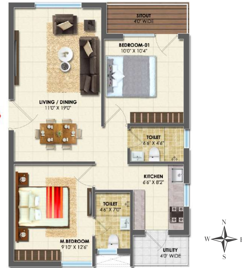
TYPE 6 | 2 BHK | 935 SQ. FT. | WEST FACING