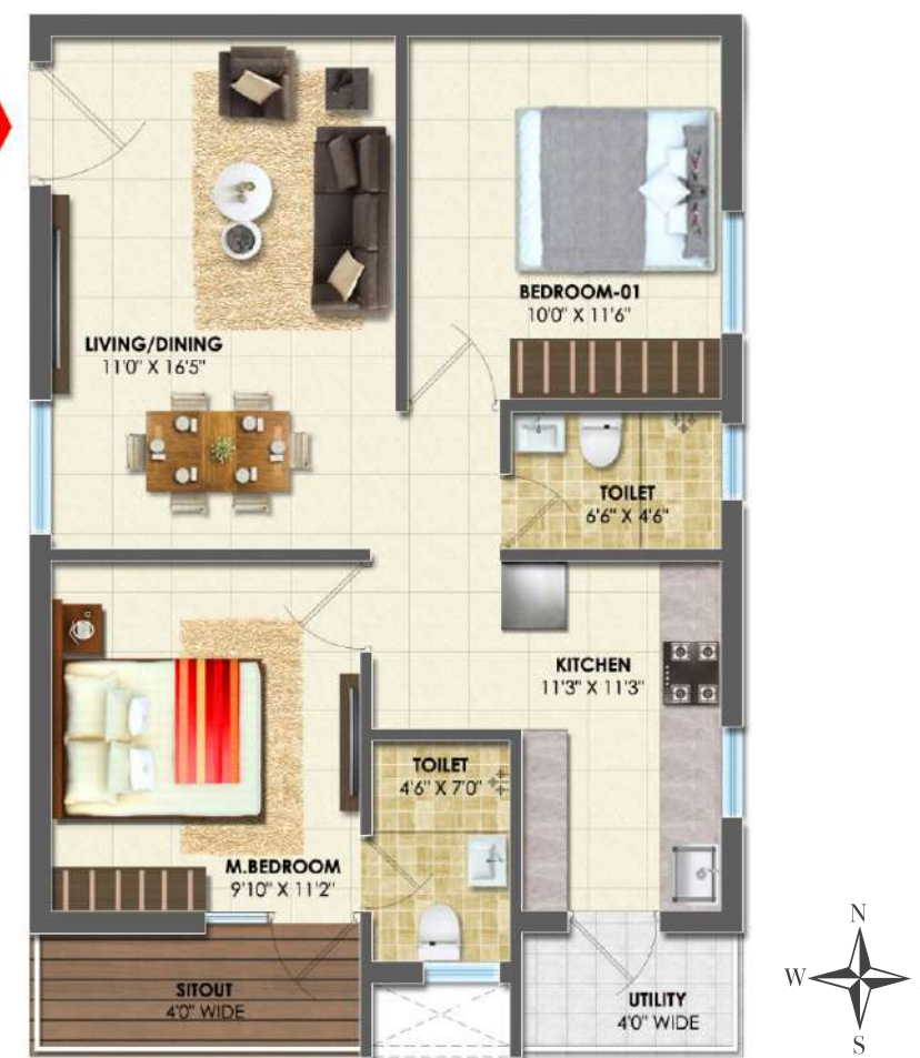
TYPE 7 | 2 BHK | 935 SQ. FT. | WEST FACING