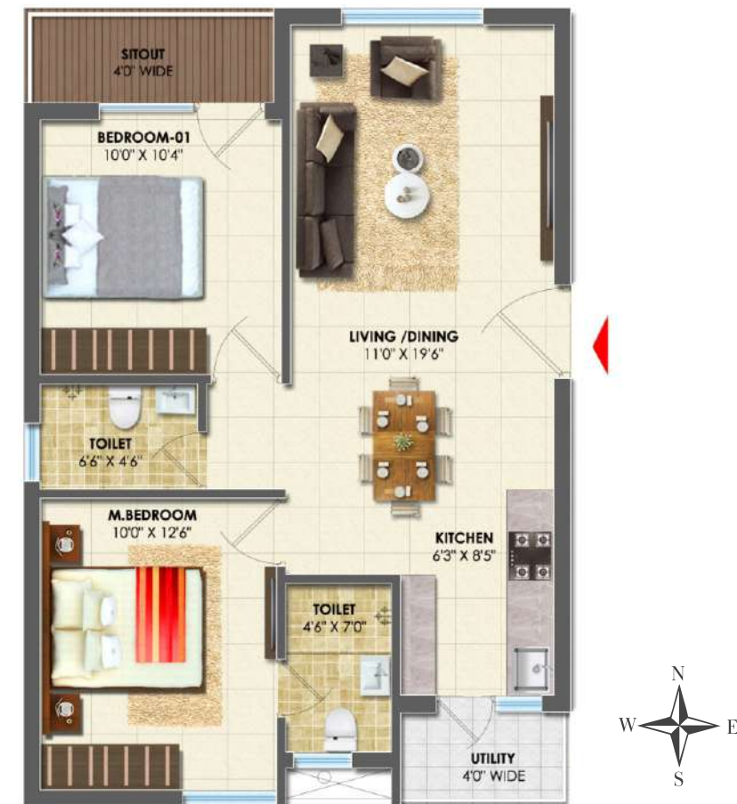
TYPE 5 | 2 BHK | 935 SQ. FT. | EAST FACING