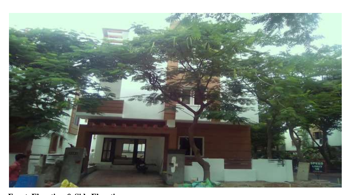
Front Elevation & Side Elevation