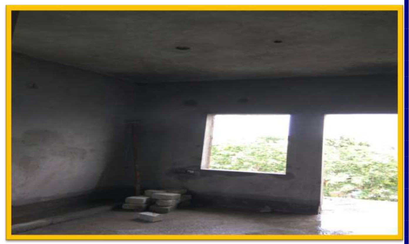
Fourth Floor Internal Plastering work