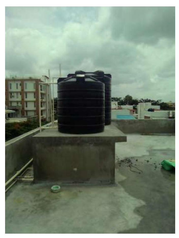
Overhead Tank and Parking Tiles work