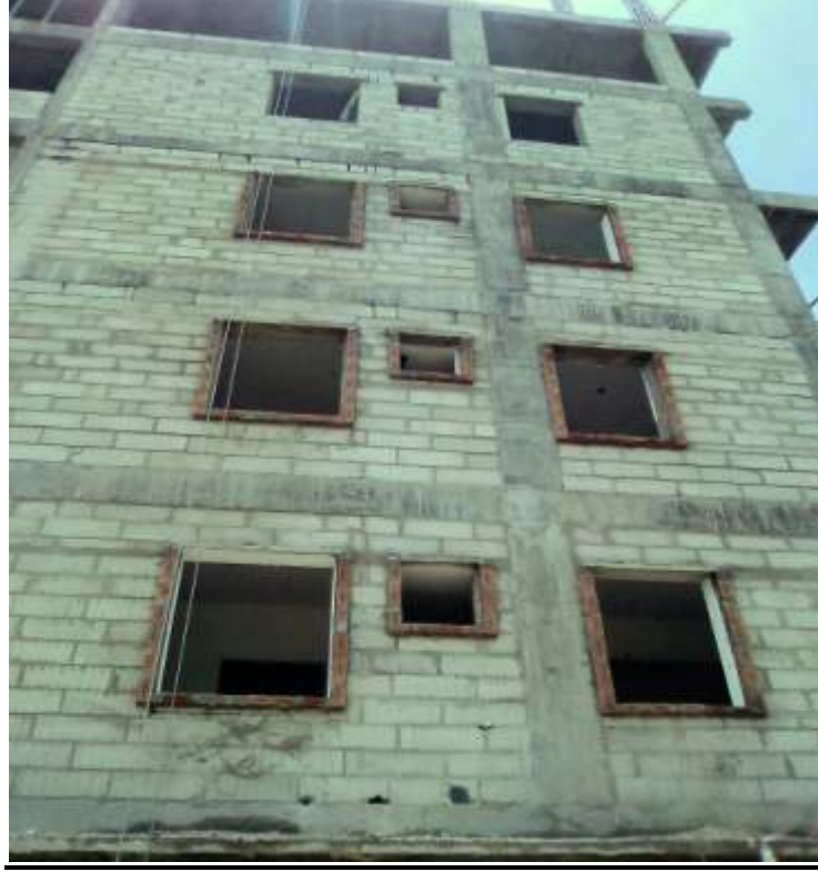
External Elevation work