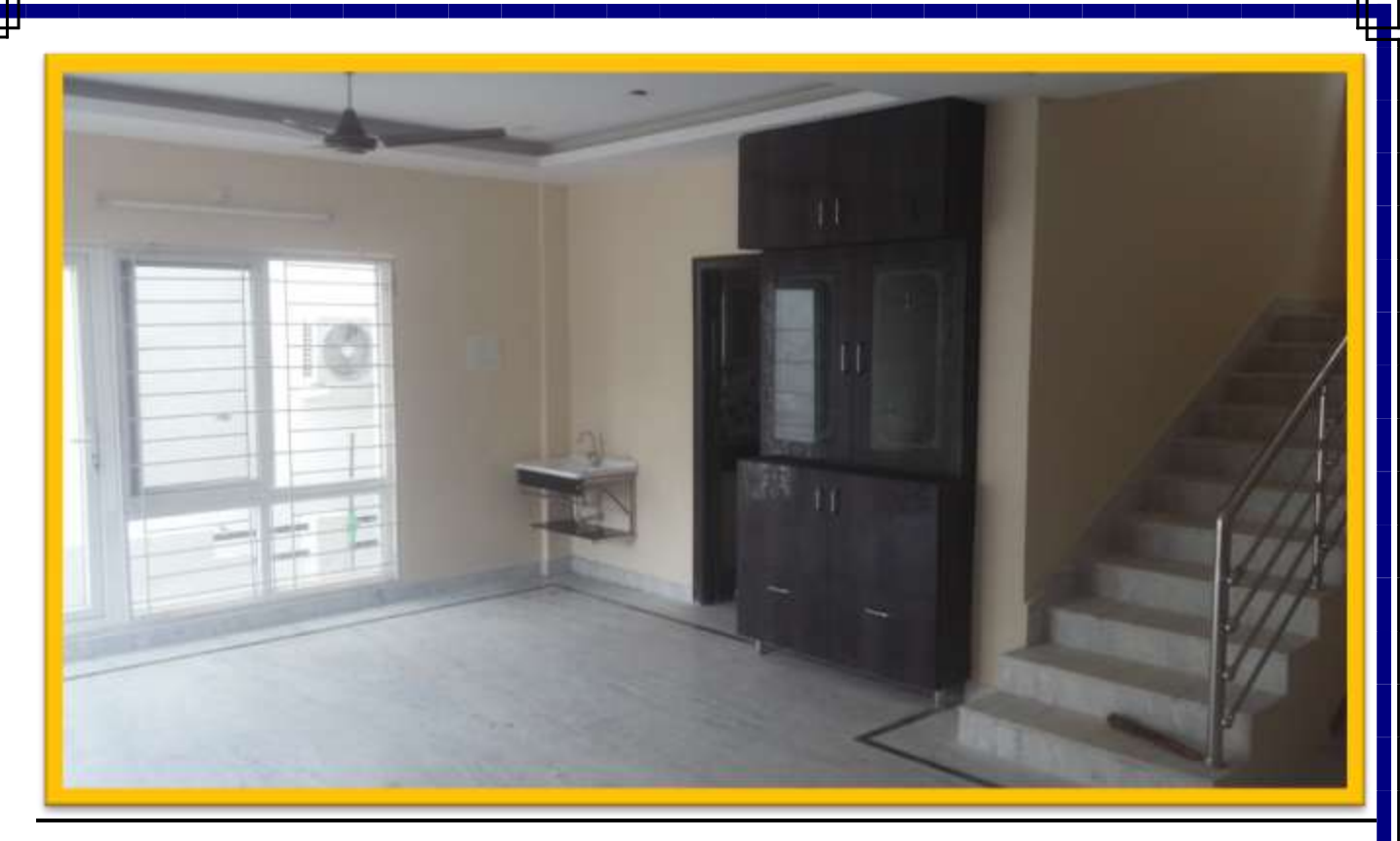
Drawing / Living Hall Area