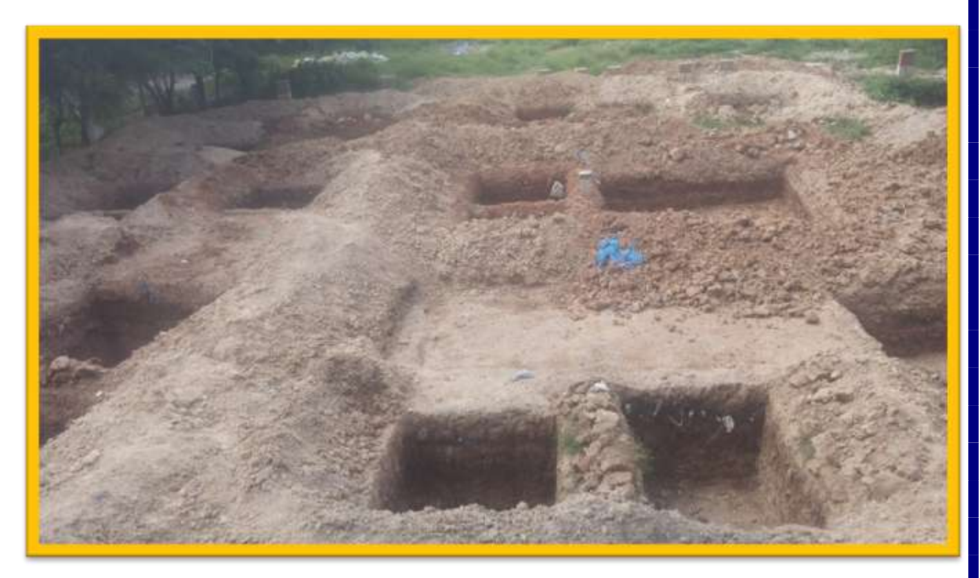
Footing Pits Excavation work