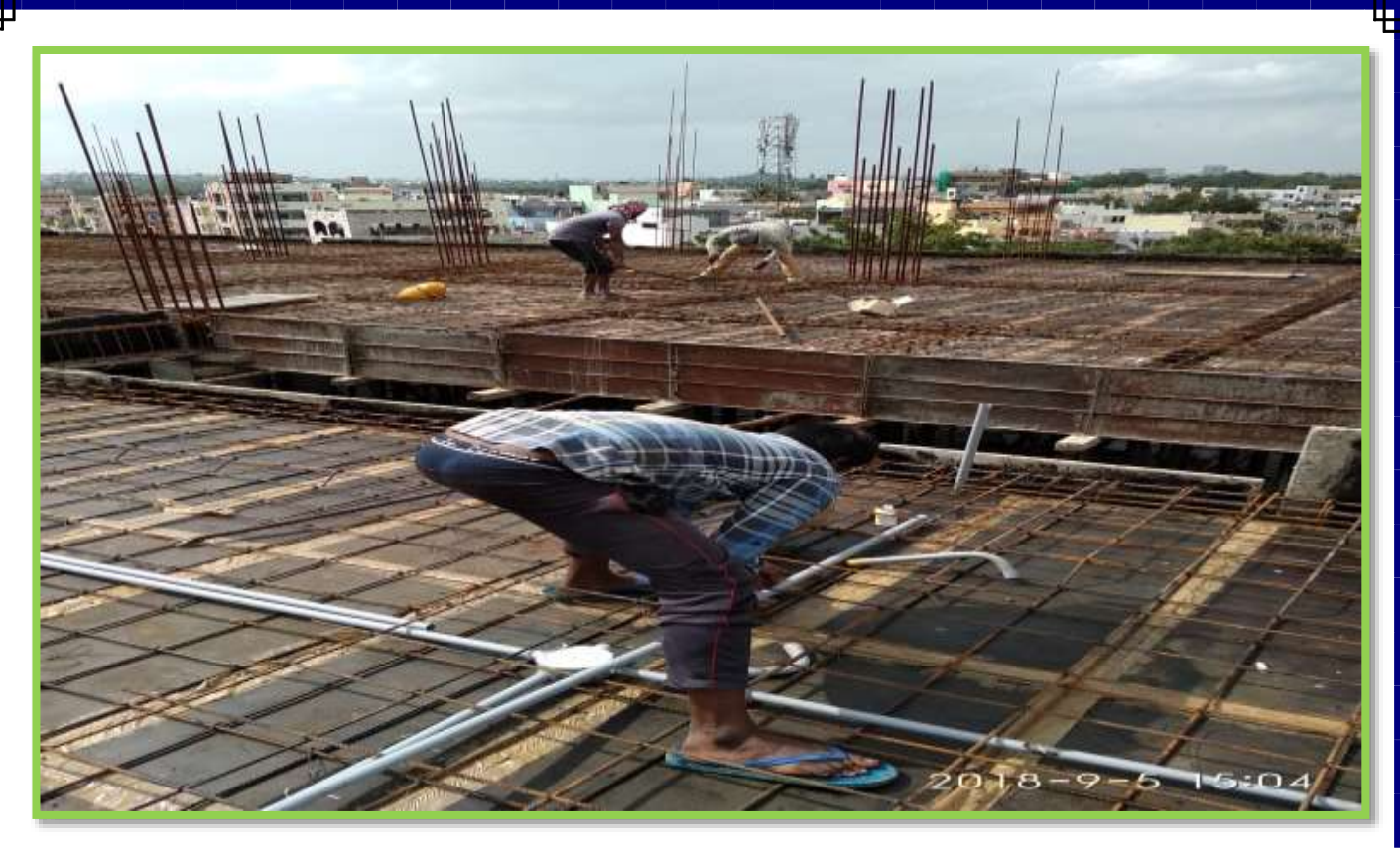
4<sup>TH</sup> FLOOR SLAB BAR BENDING WORK CUM ELECTRICAL WORK