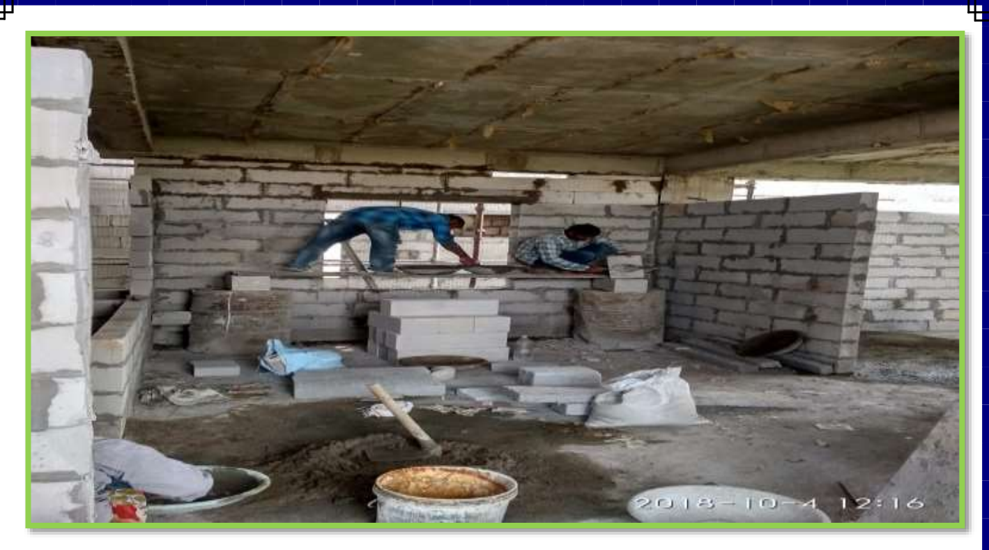
BRICK WORK IN PROGRESS