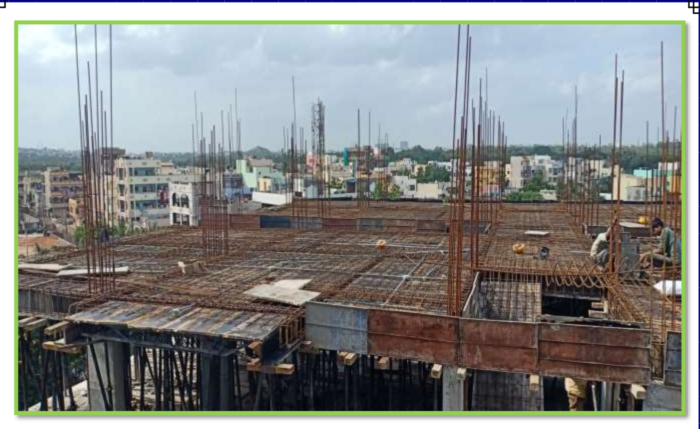
4<sup>TH</sup> FLOOR SLAB BAR BENDING WORK CUM ELECTRICAL WORK