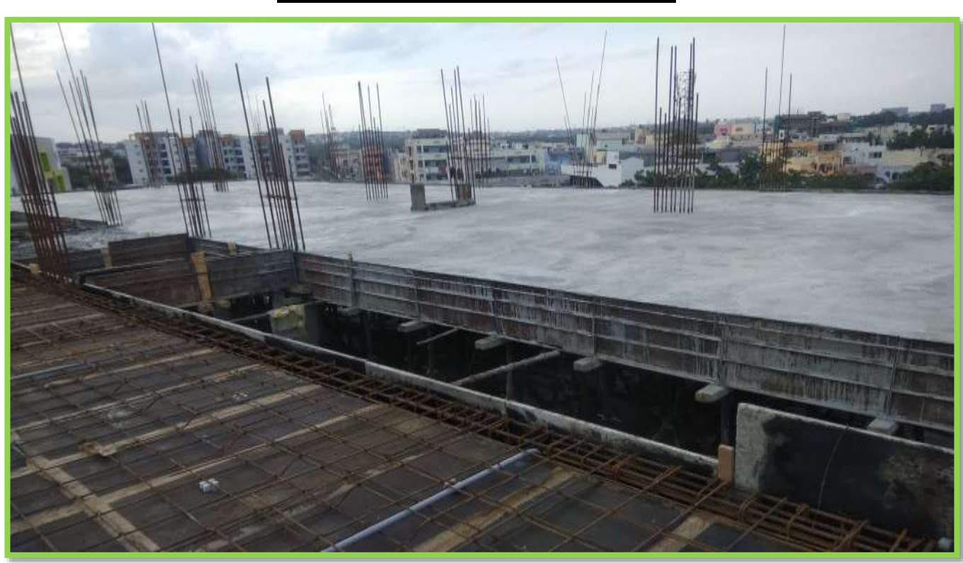
STARLITE SPINTECH LIMITED