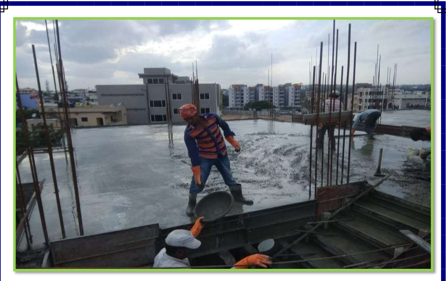
4<sup>TH</sup> FLOOR SLAB CONCRETE WORK