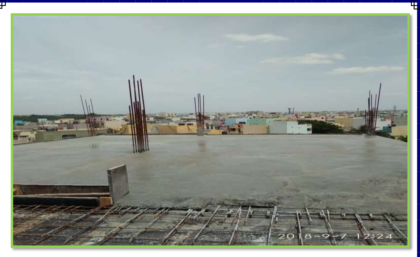
4<sup>TH</sup> FLOOR SLAB CONCRETE WORK