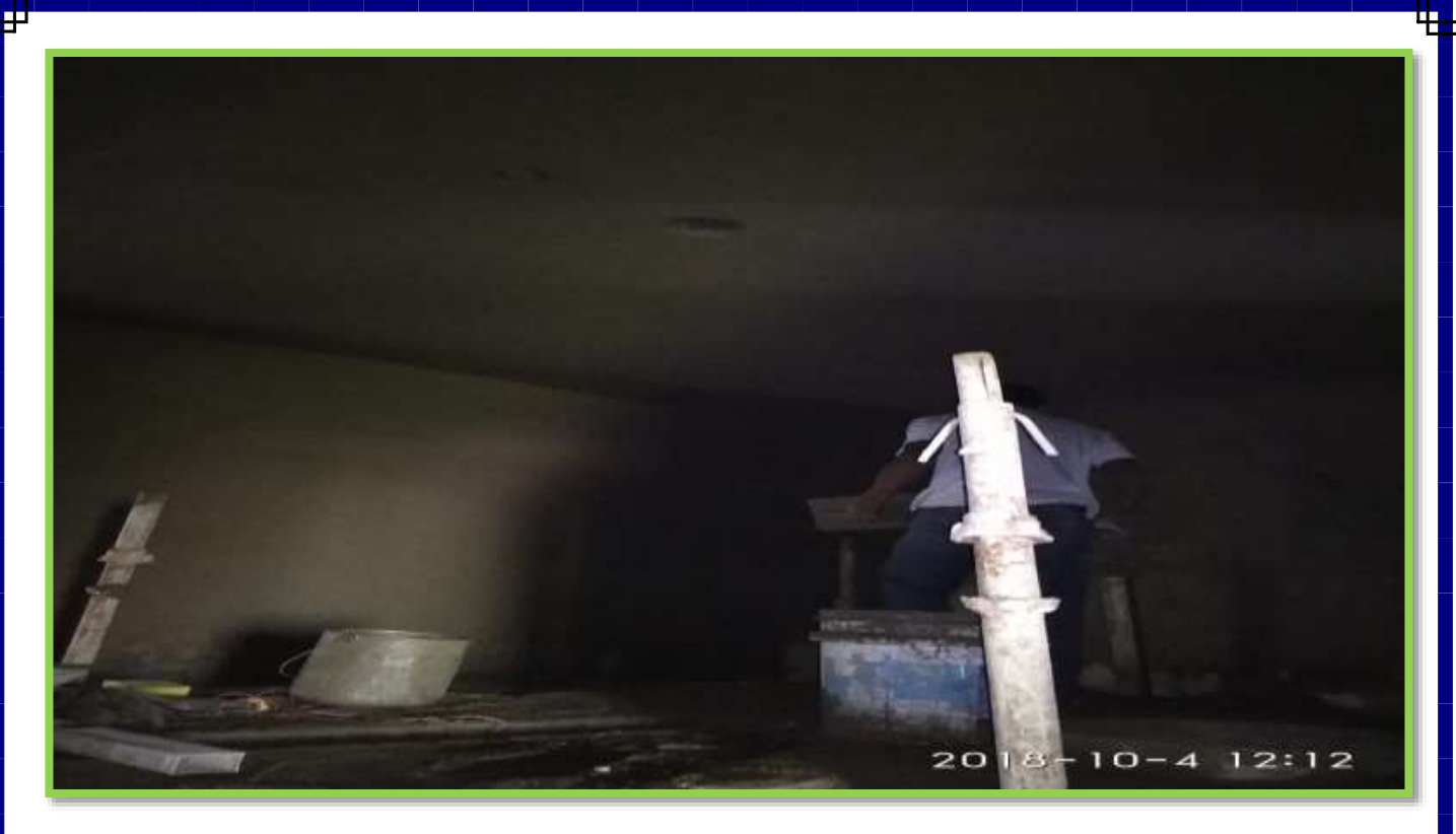
INTERNAL PLASTERING WORK