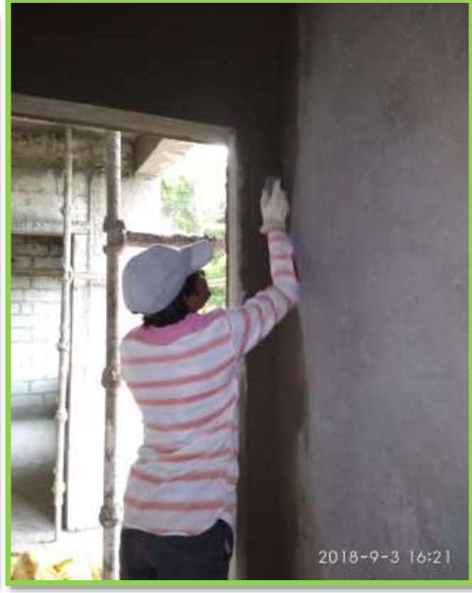
INTERNAL PLASTERING WORK