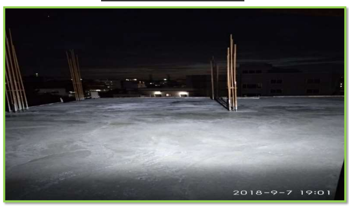
STARLITE SPINTECH LIMITED