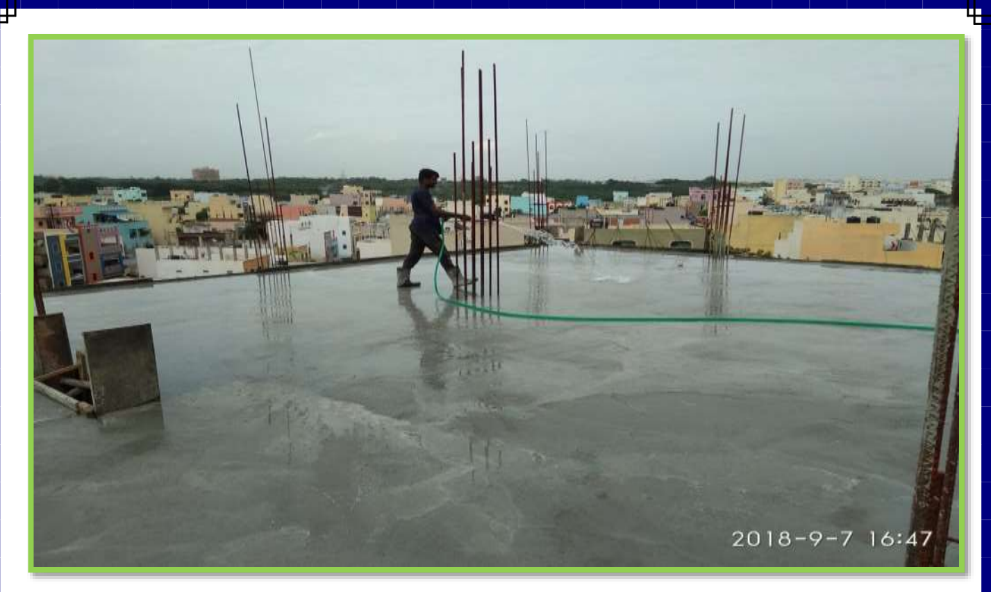
4<sup>TH</sup> FLOOR SLAB CONCRETE WORK