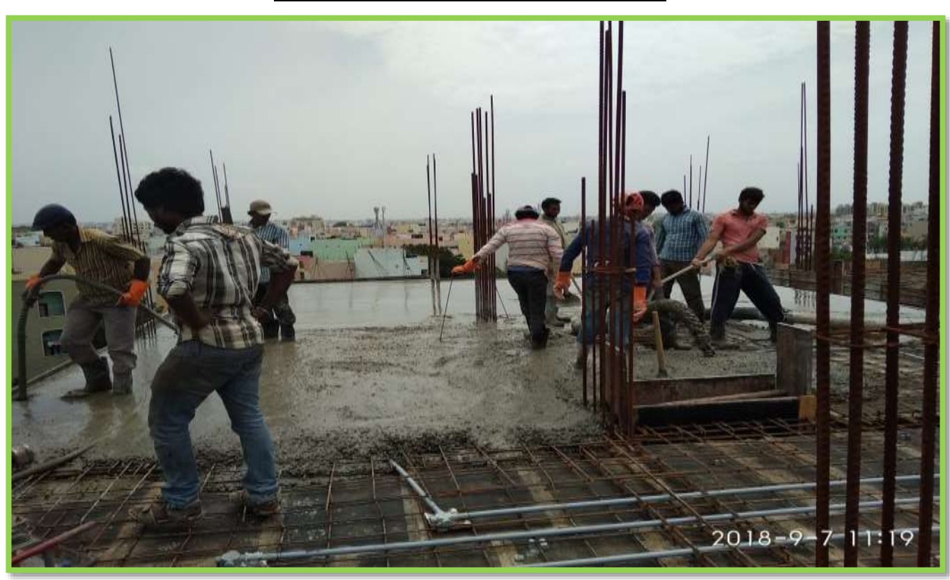
STARLITE SPINTECH LIMITED