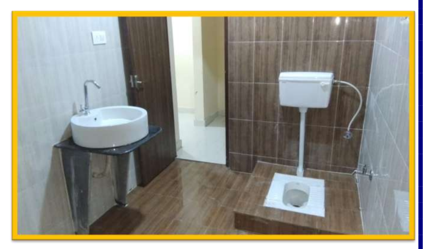
FINISHING TOILET WORK COMPLETED