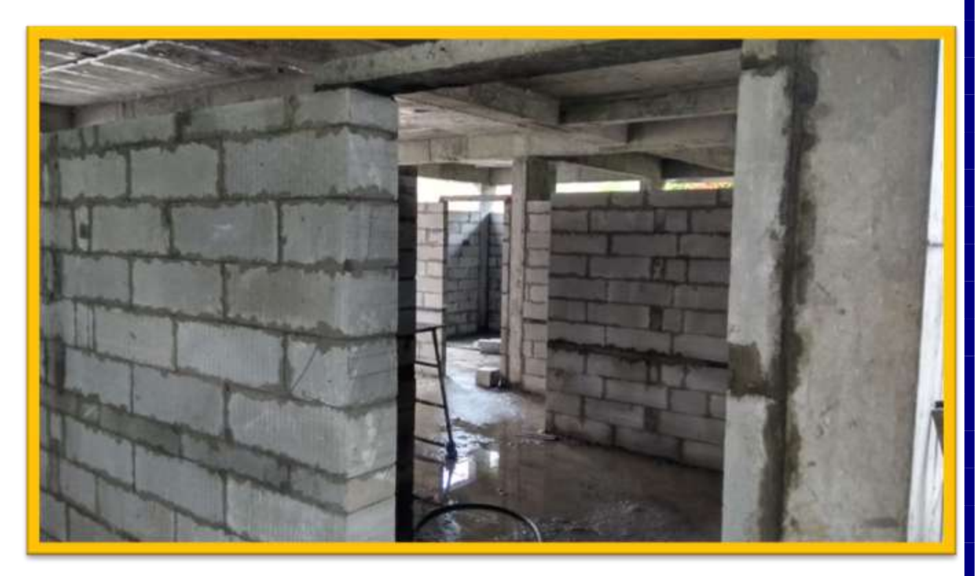
FIRST FLOOR BRICK WORK