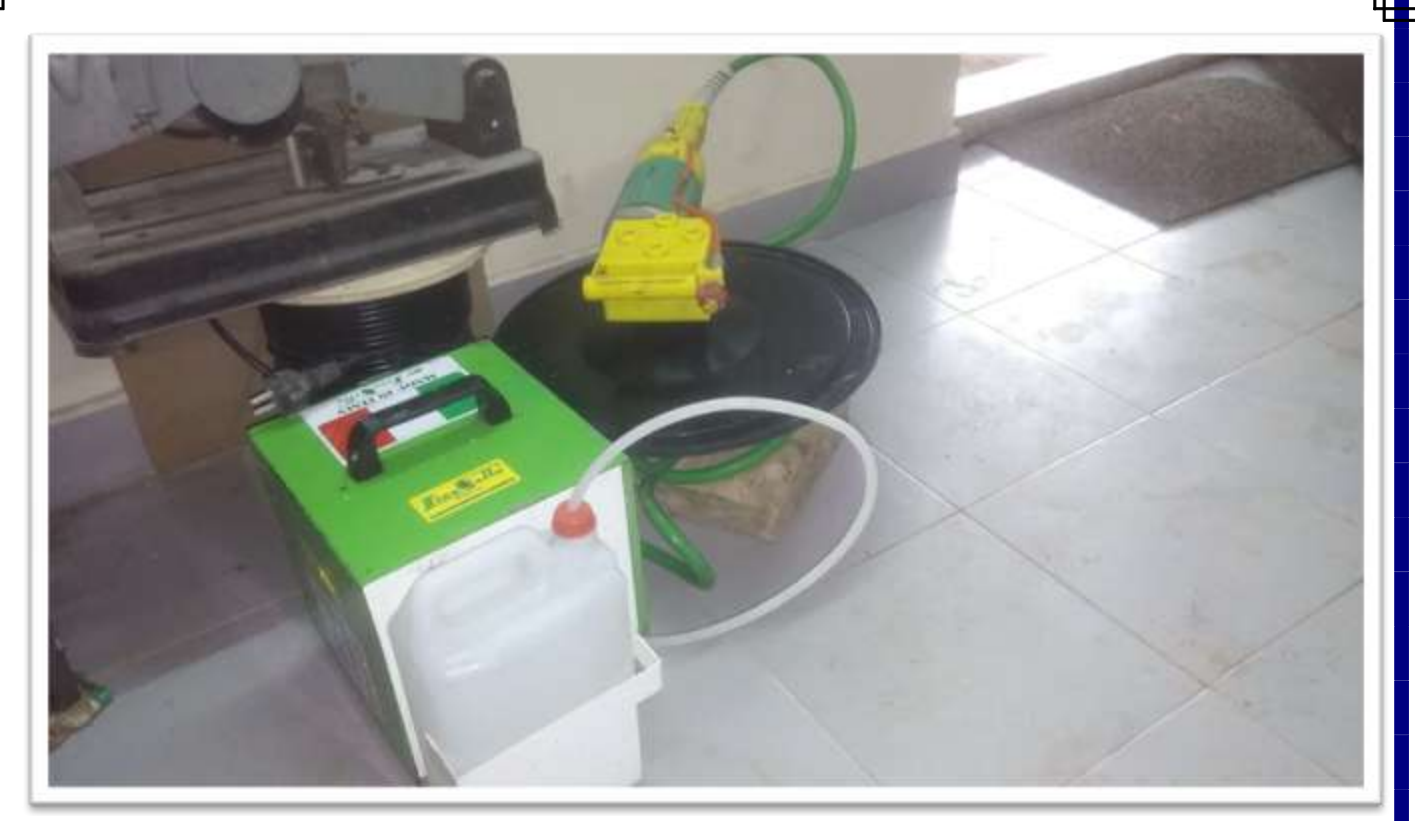
PASTERING FINISHING MACHINE