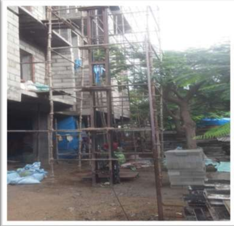
STARLITE SPINTECH LIMITED