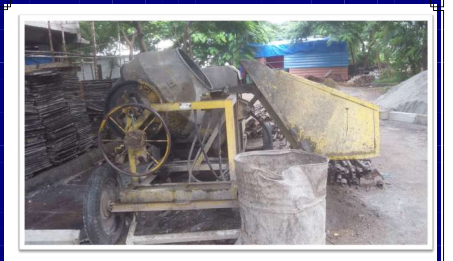
CONCRETE MIXING MILLER MACHINE