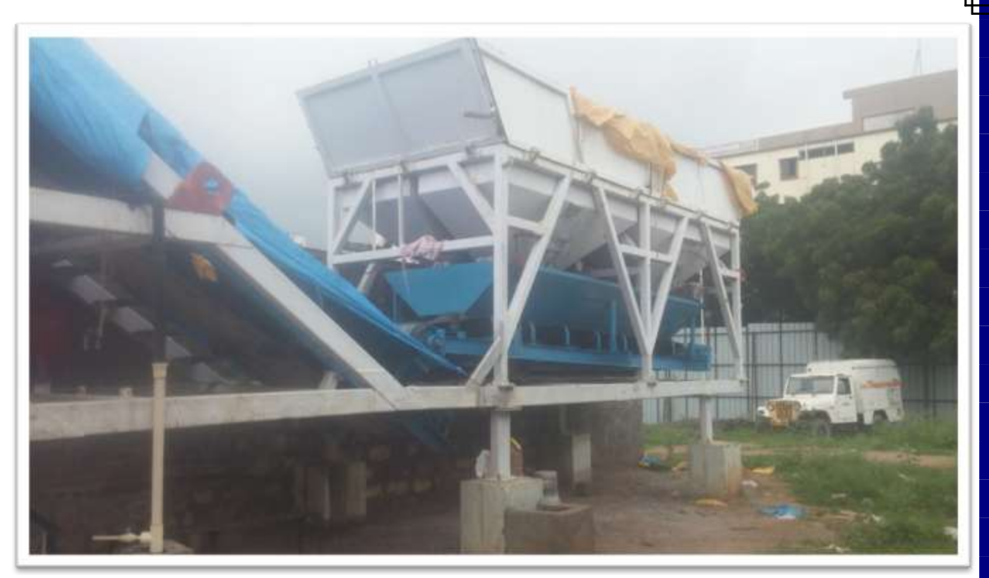
READY MIX CONCRETE MIXING BATCHING PLANT