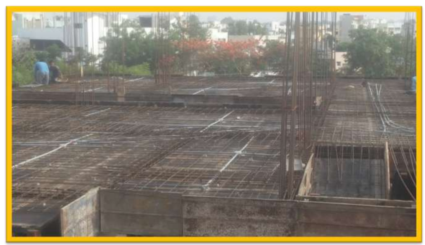
2<sup>nd</sup> FLOOR SLAB SHUTTERING & BAR BENDING WORK