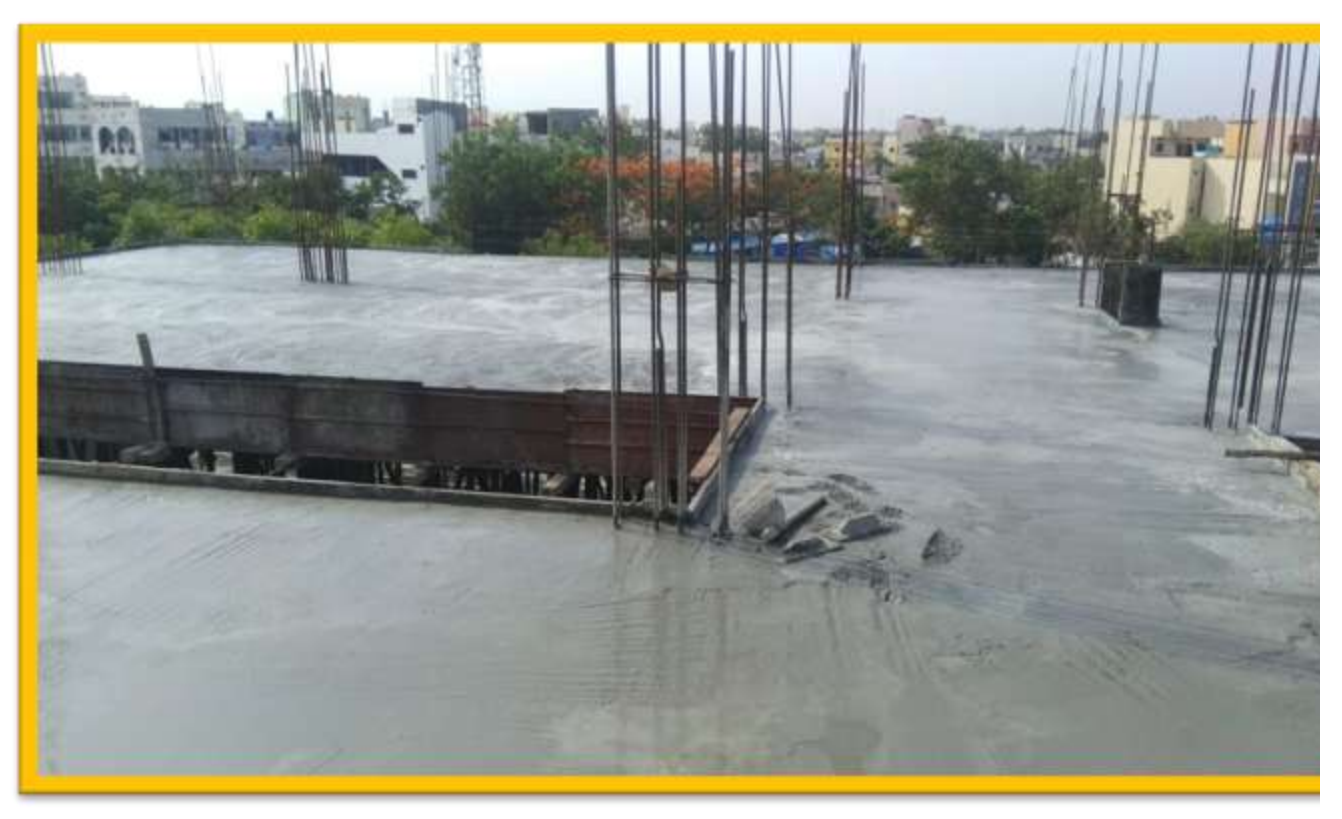
STARLITE SPINTECH LIMITED