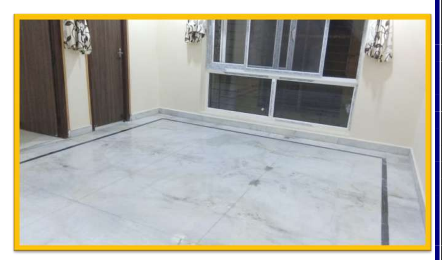
FINISHING WORK COMPLETED