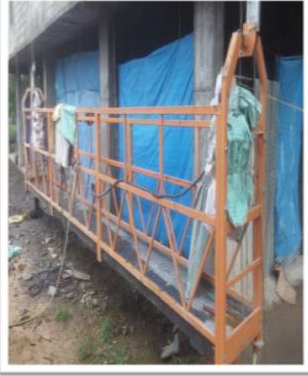
STARLITE SPINTECH LIMITED