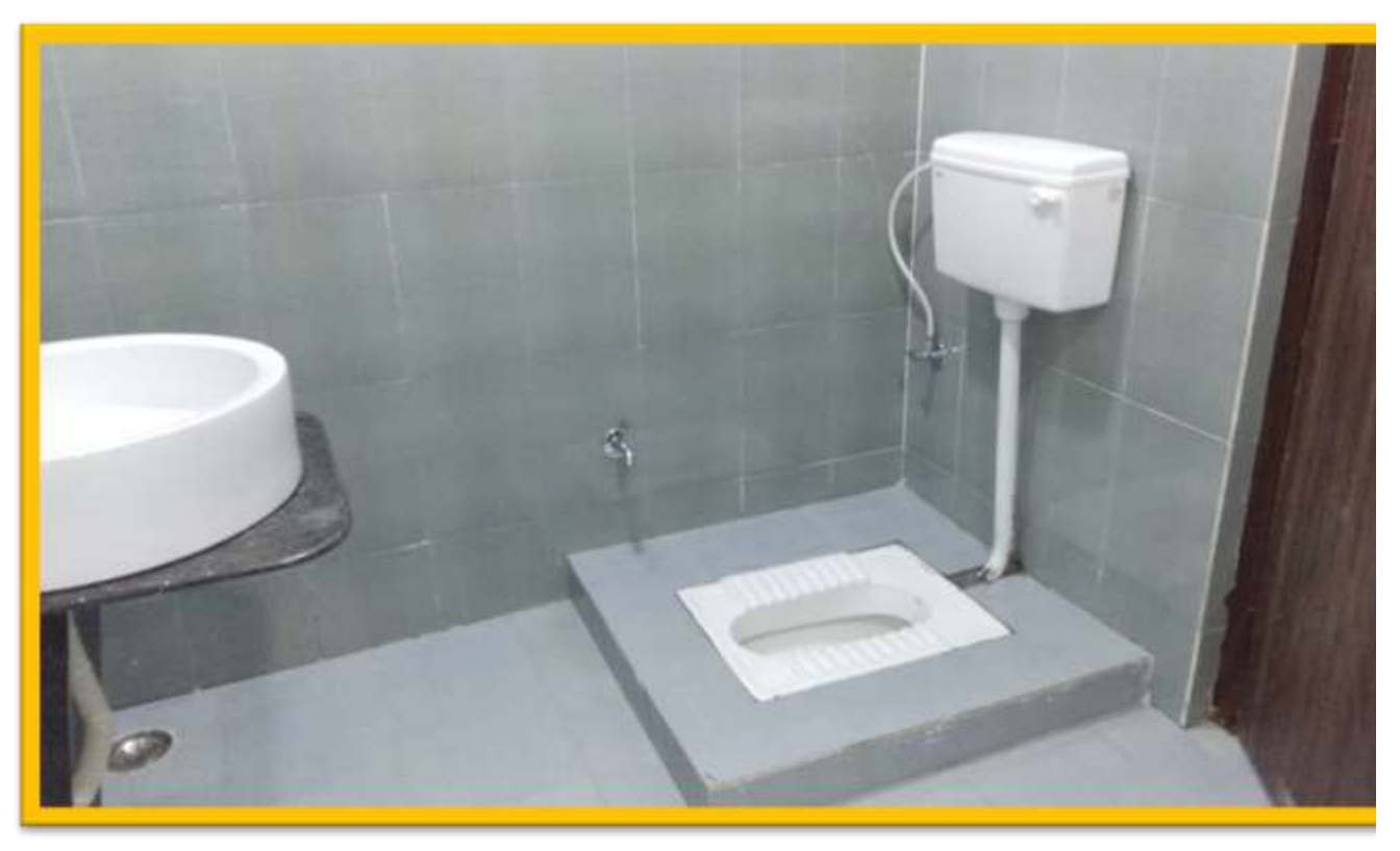
STARLITE SPINTECH LIMITED