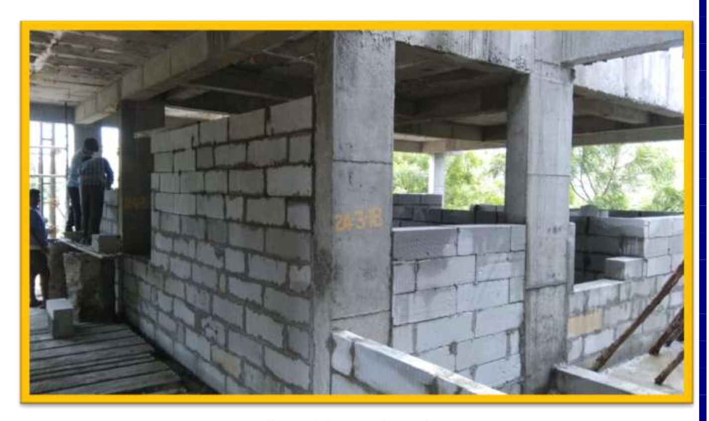
FIRST FLOOR BRICK WORK