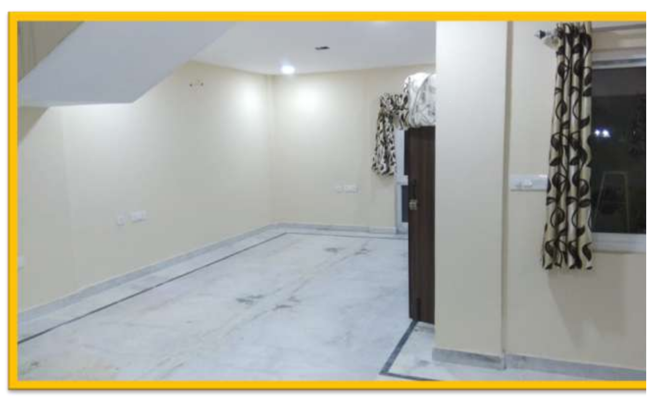
STARLITE SPINTECH LIMITED