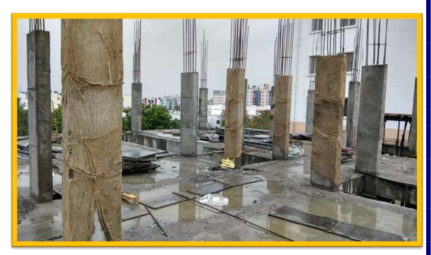
3<sup>RD</sup> FLOOR COLUMNS CONCRETE WORK