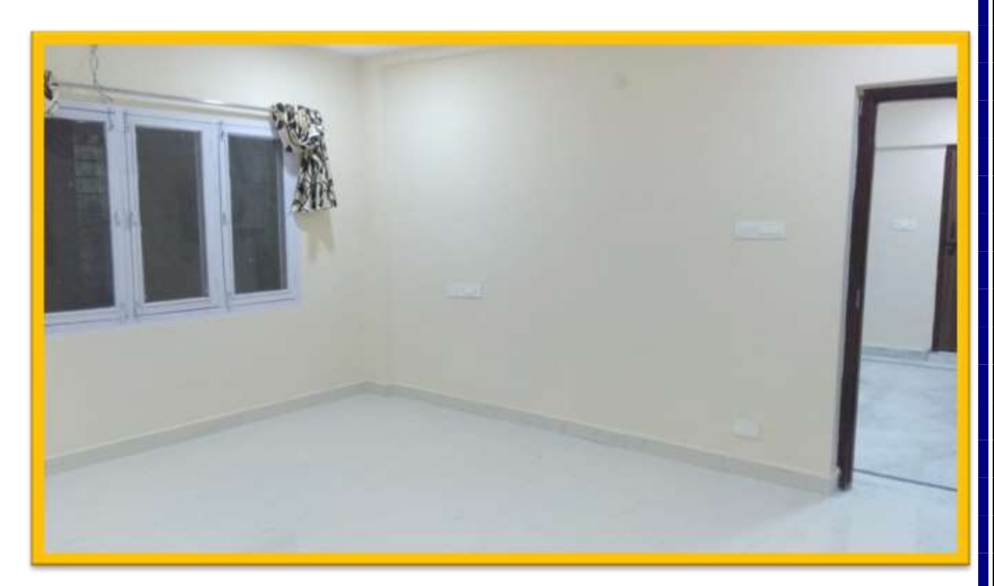
FINISHING WORK COMPLETED