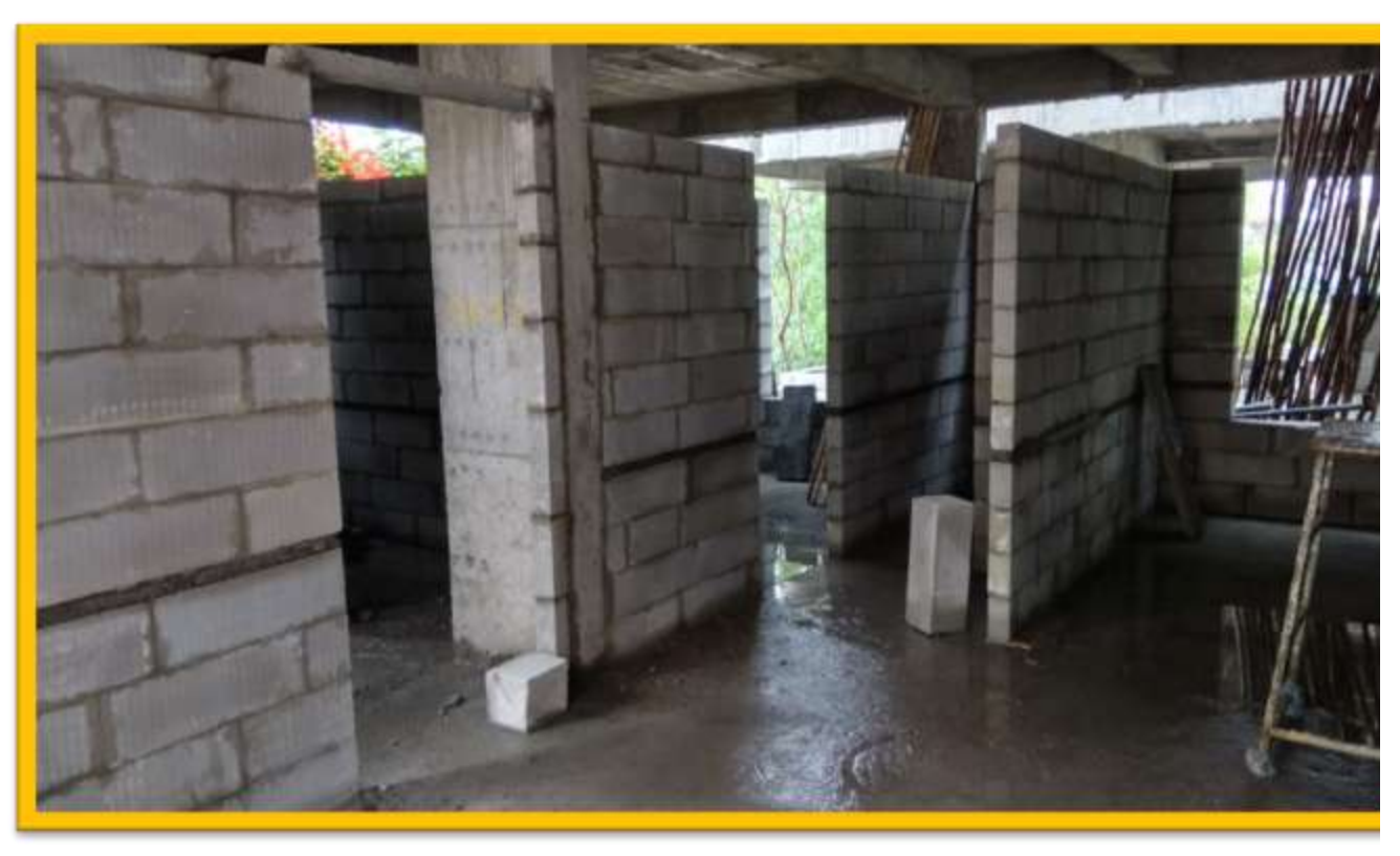
STARLITE SPINTECH LIMITED