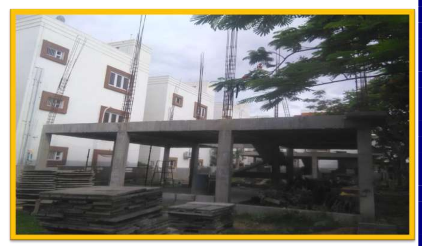
\underline{\textbf{GROUND FLOOR SLAB AND 1}^{\text{ST}} \textbf{ FLOOR COLUMNS STEEL OVERLAPPING}}