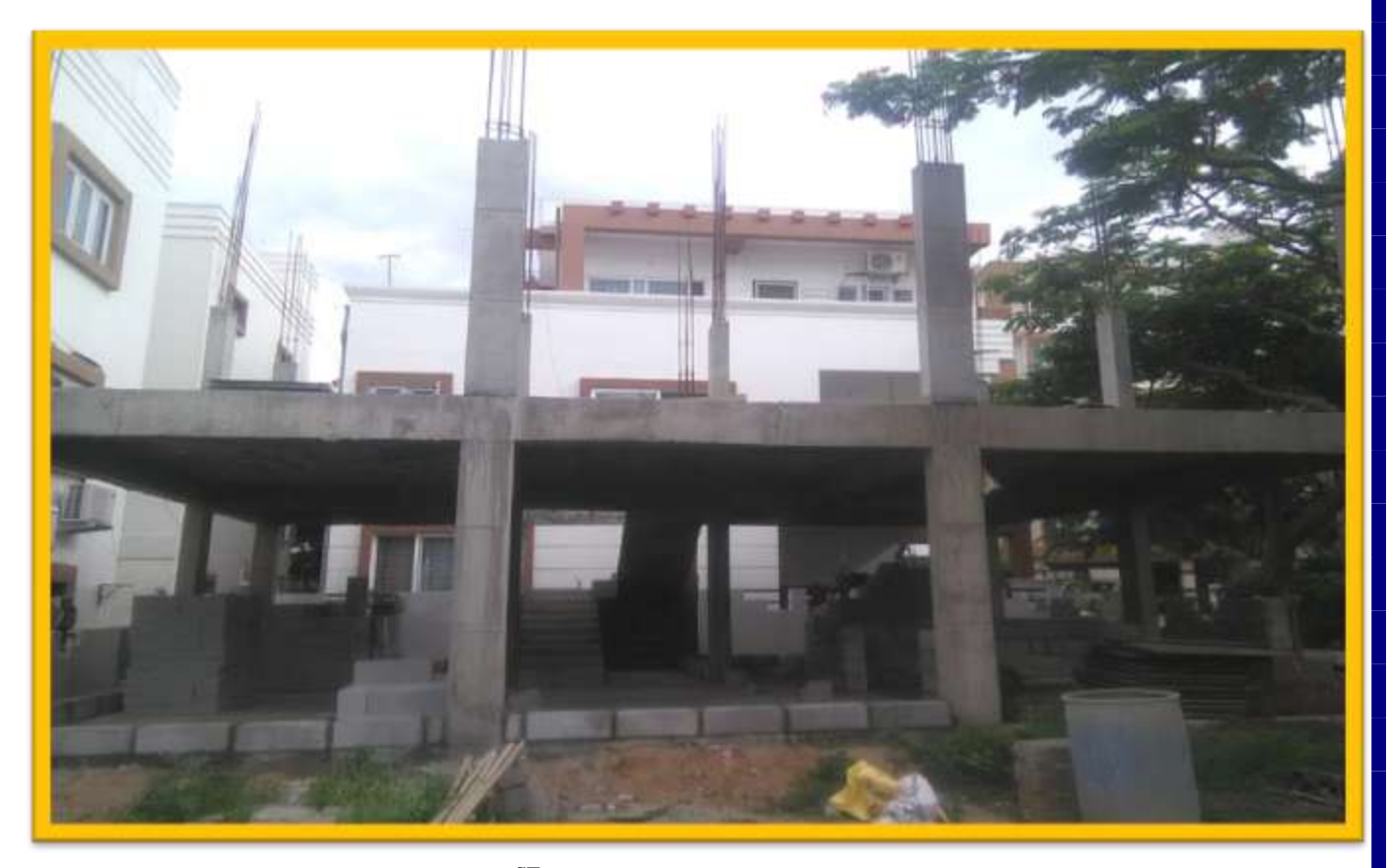
GROUND FLOOR SLAB AND 1<sup>ST</sup> FLOOR COLUMNS CONCRETE & GR,FLR BRICK WORK IN PROGRESS.