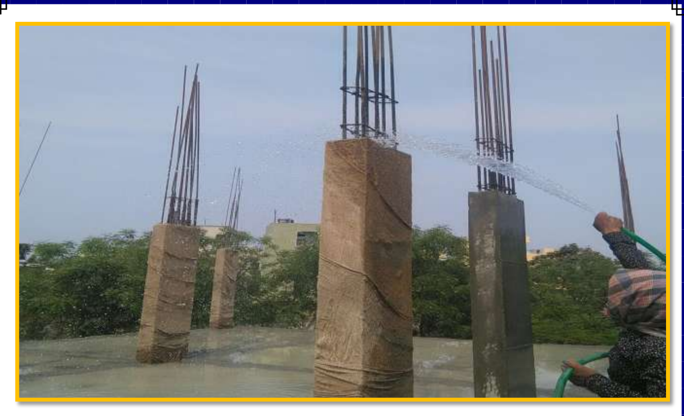
3<sup>RD</sup> SLAB COUMNS CONCRETE WORK