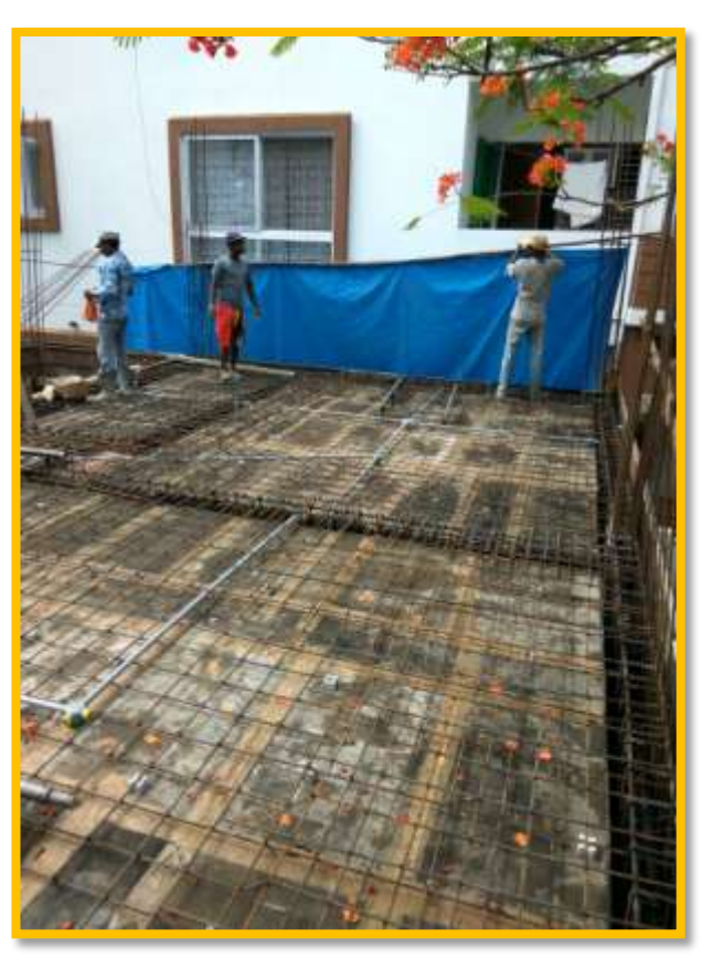
SLAB CONCRETE WORK