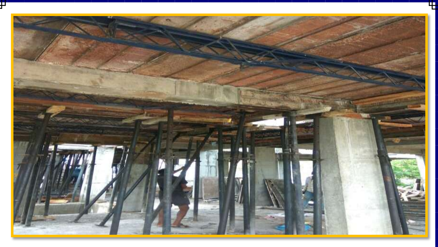
2<sup>ND</sup> SLAB DE- SHUTTERING WORK