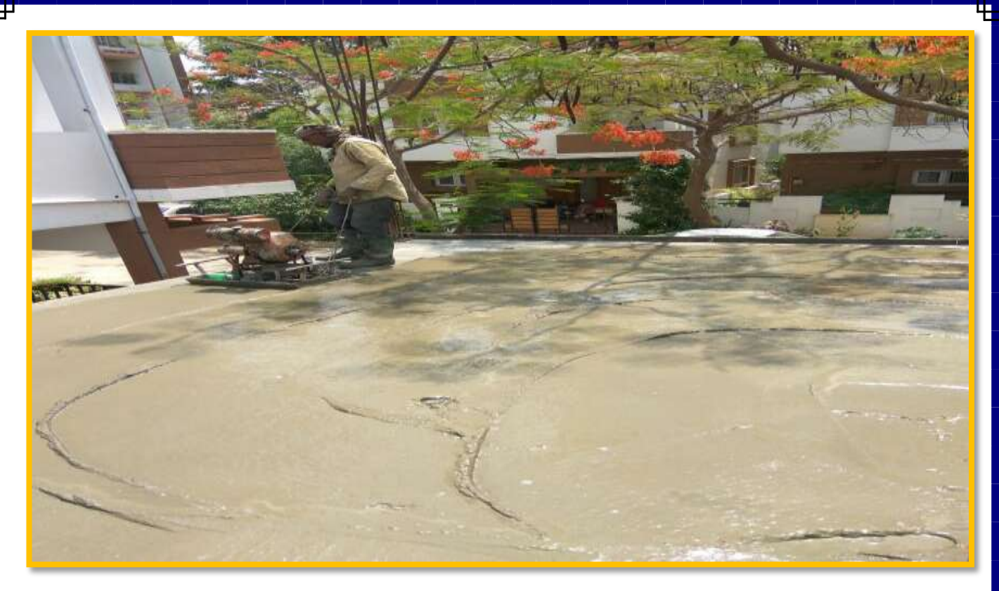
SLAB CONCRETE WORK