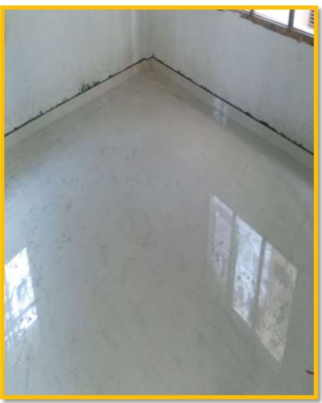
BED ROOMS & BALCONY TILES LAYING WORK