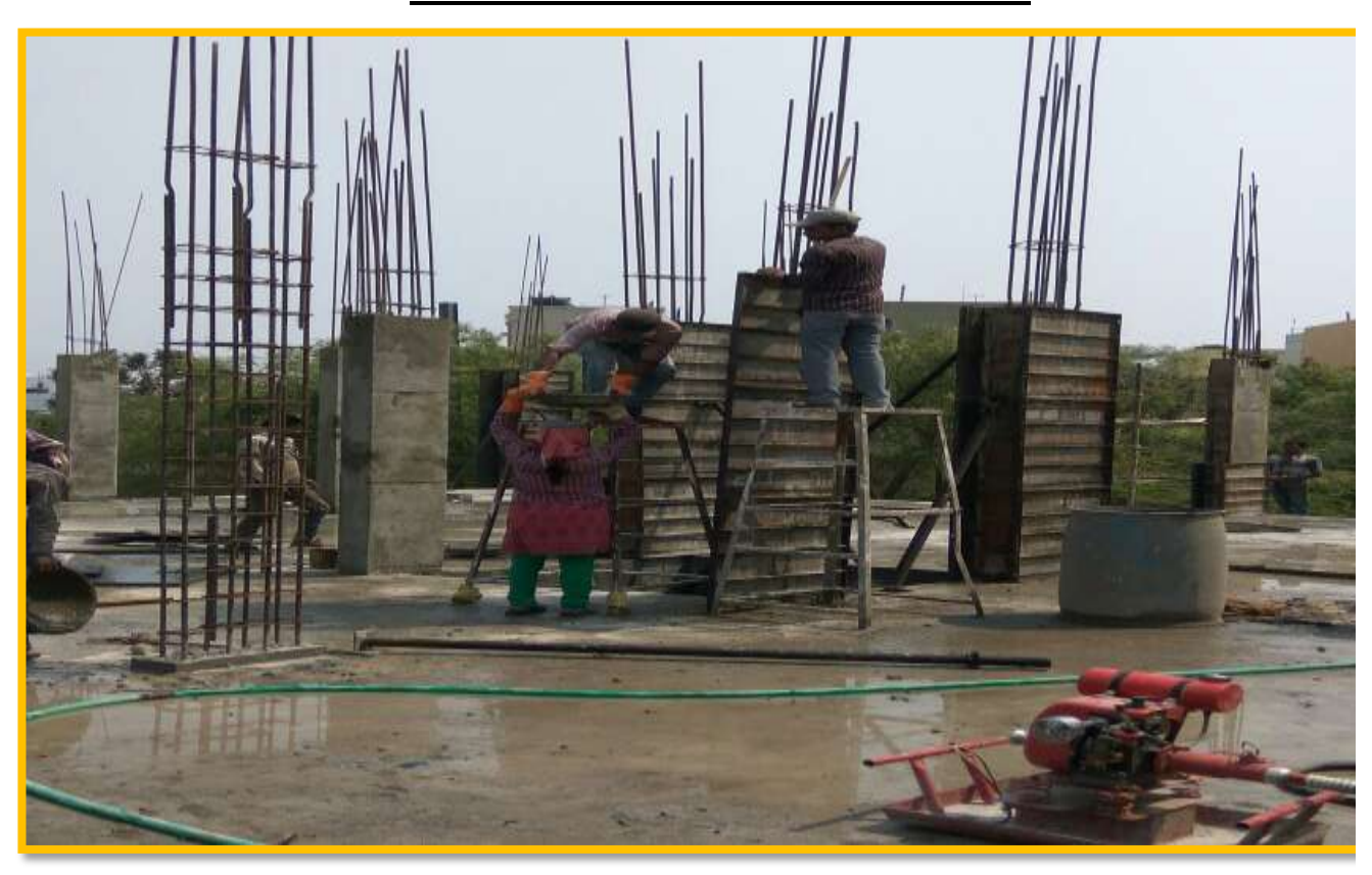
STARLITE SPINTECH LIMITED