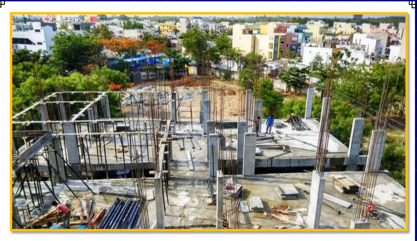
3<sup>RD</sup> SLAB SHUTTERING WORK IN PROGRESS