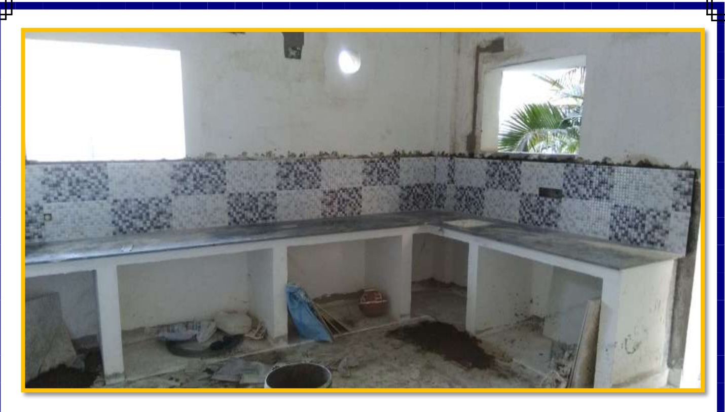
KITCHEN/PARKING AND TERRACE TILES LAYING WORK