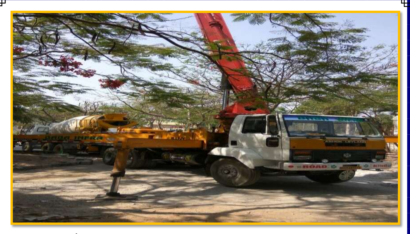
2<sup>nd</sup> SLAB CONCRETE WORK WITH BOOMER MACHINE