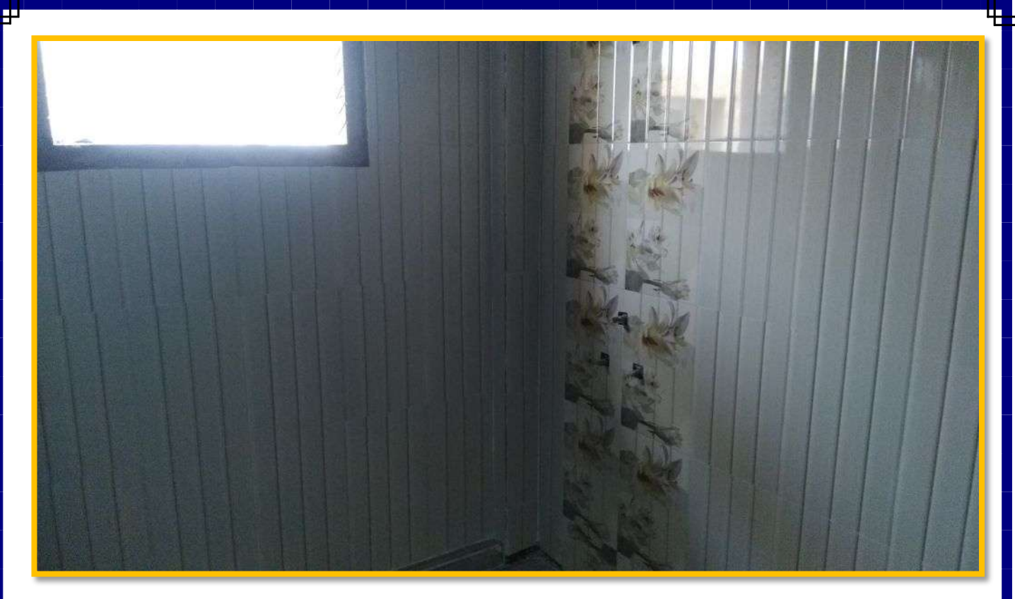
BATHROOM WALL DADO & FLOOR TILES LAYING WORK