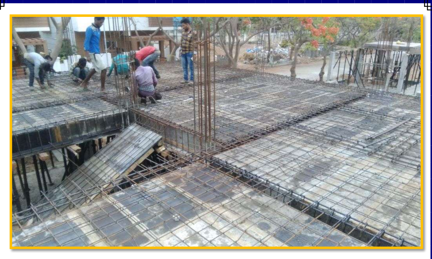
SLAB SHUTTERING AND BAR BENDING WORK