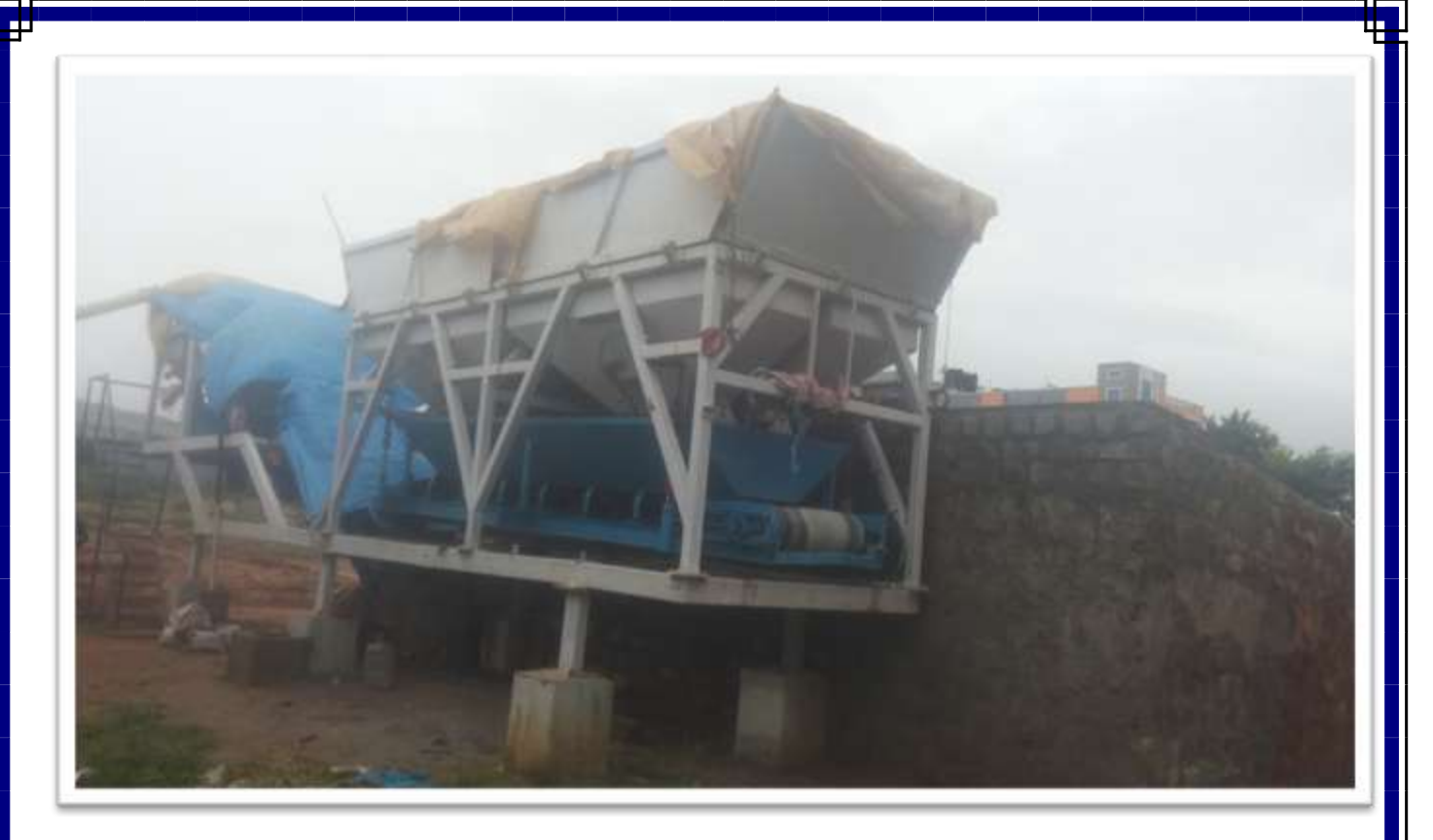
READY MIX CONCRETE MIXING BATCHING PLANT