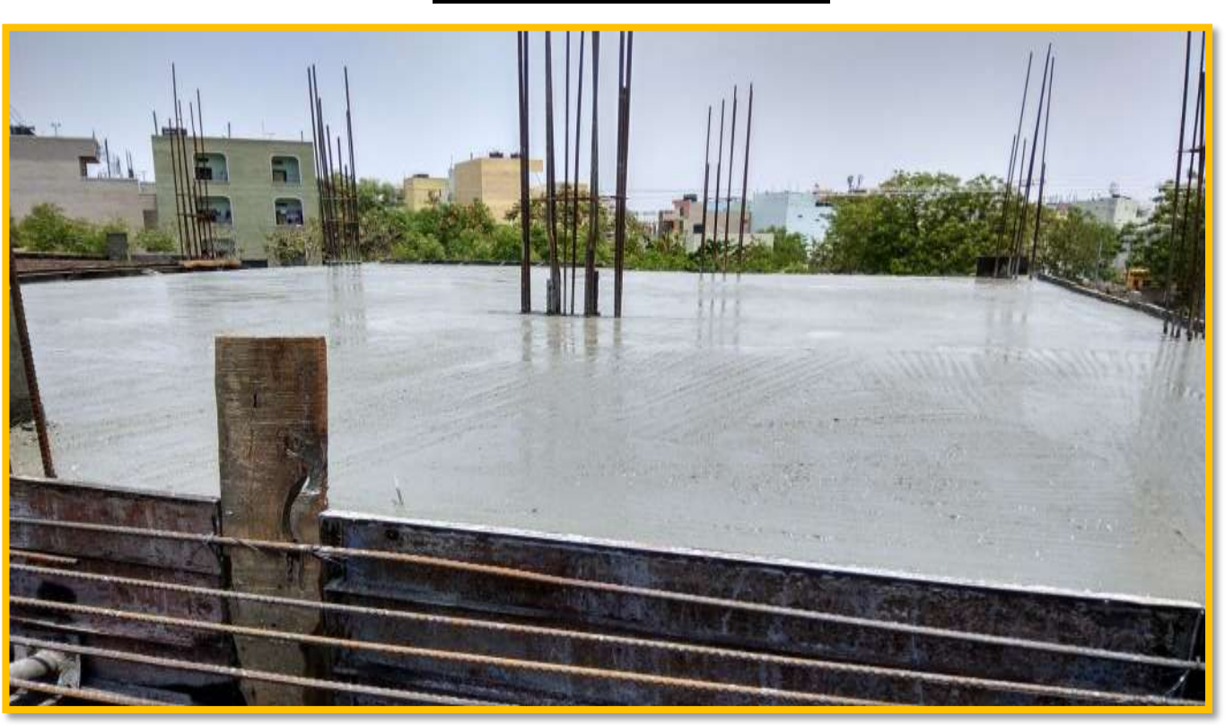
STARLITE SPINTECH LIMITED