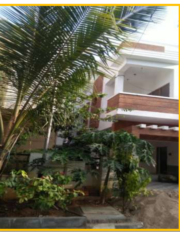
EXTERNAL PAINT WORK IN PROGRESS