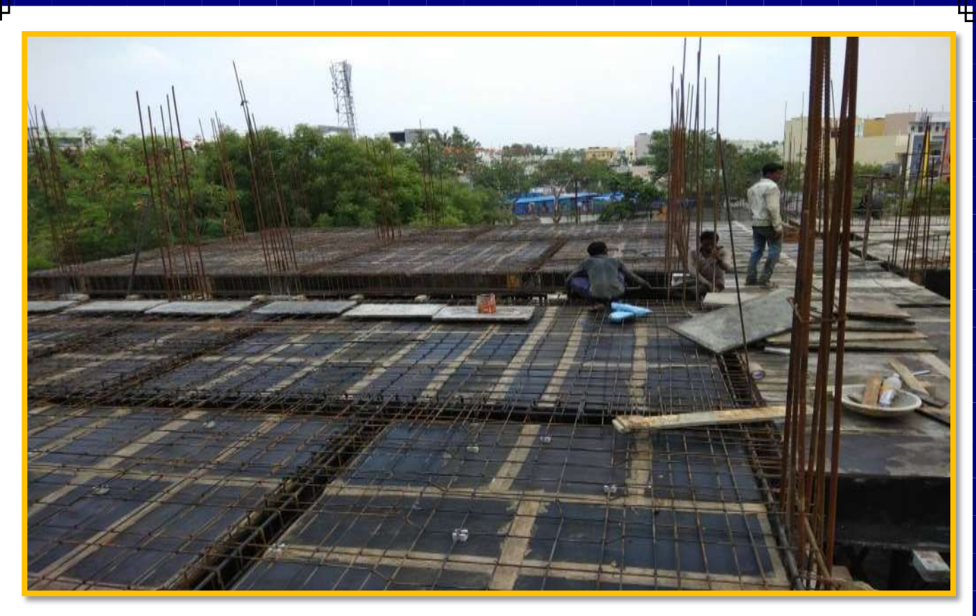
2<sup>nd</sup> SLAB BAR BENDING WORK