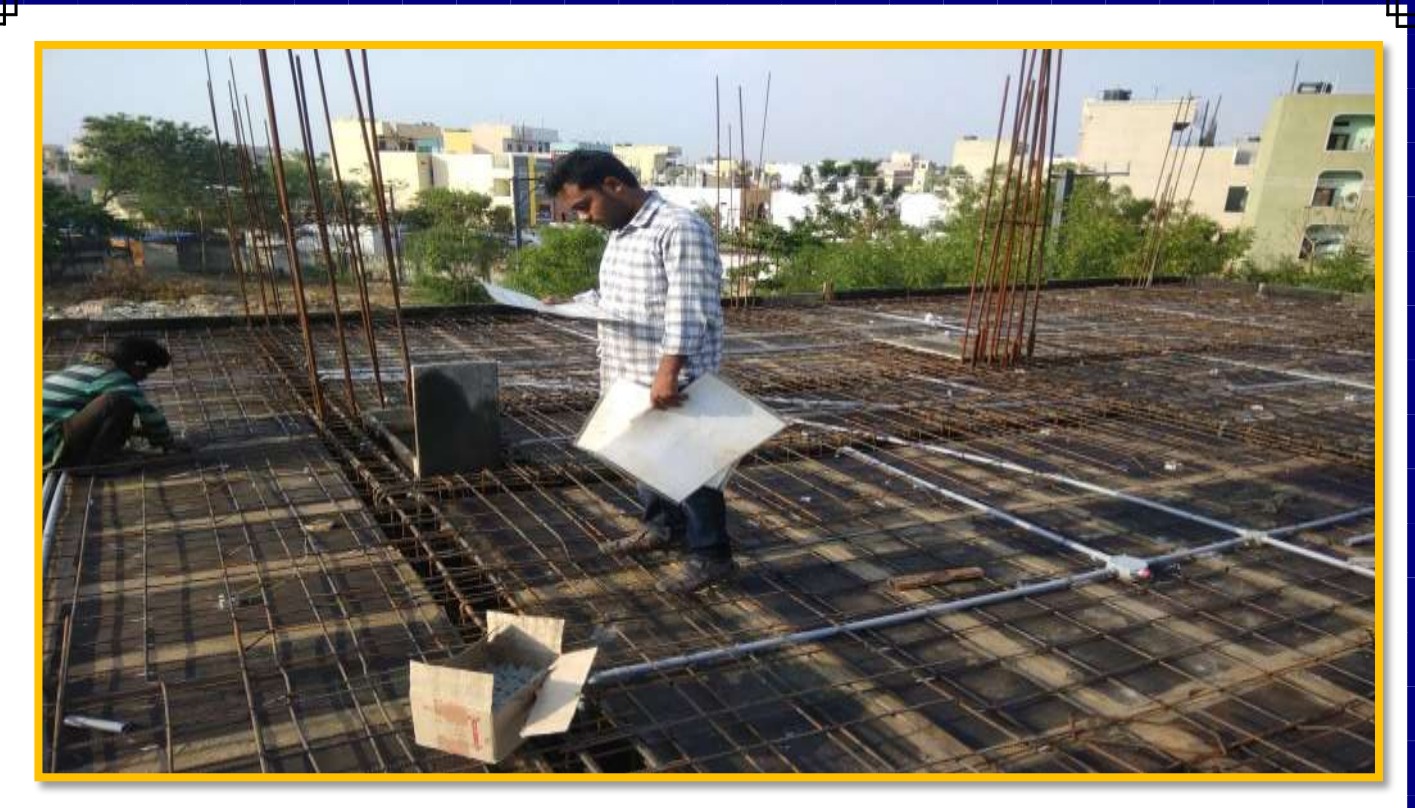
2<sup>nd</sup> SLAB BAR BENDING CHECKING WORK STRUCTURAL CONSUTANT