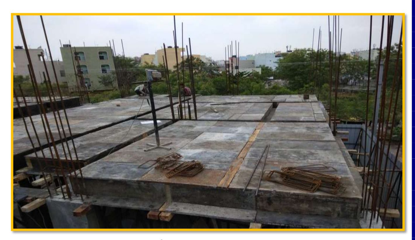
2<sup>nd</sup> SLAB SHUTTERING WORK