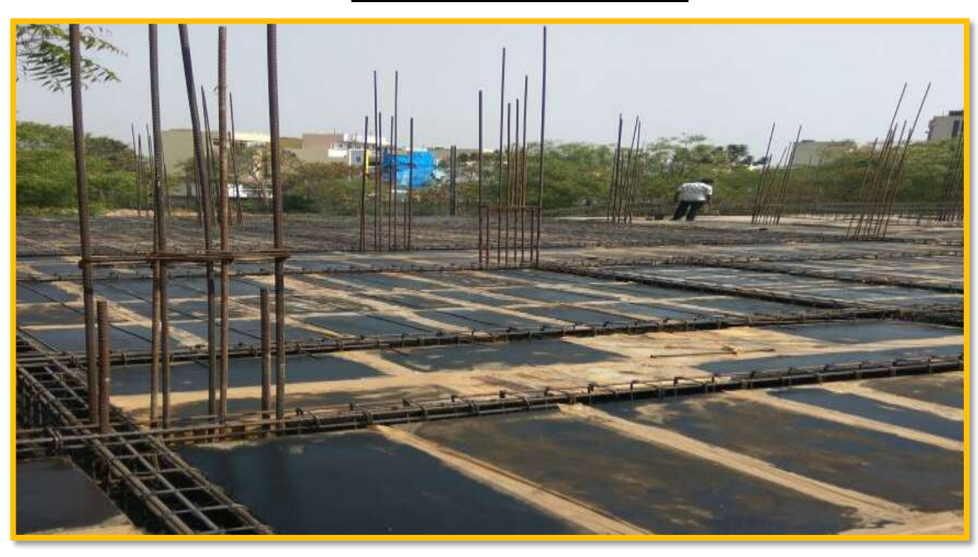
STARLITE SPINTECH LIMITED