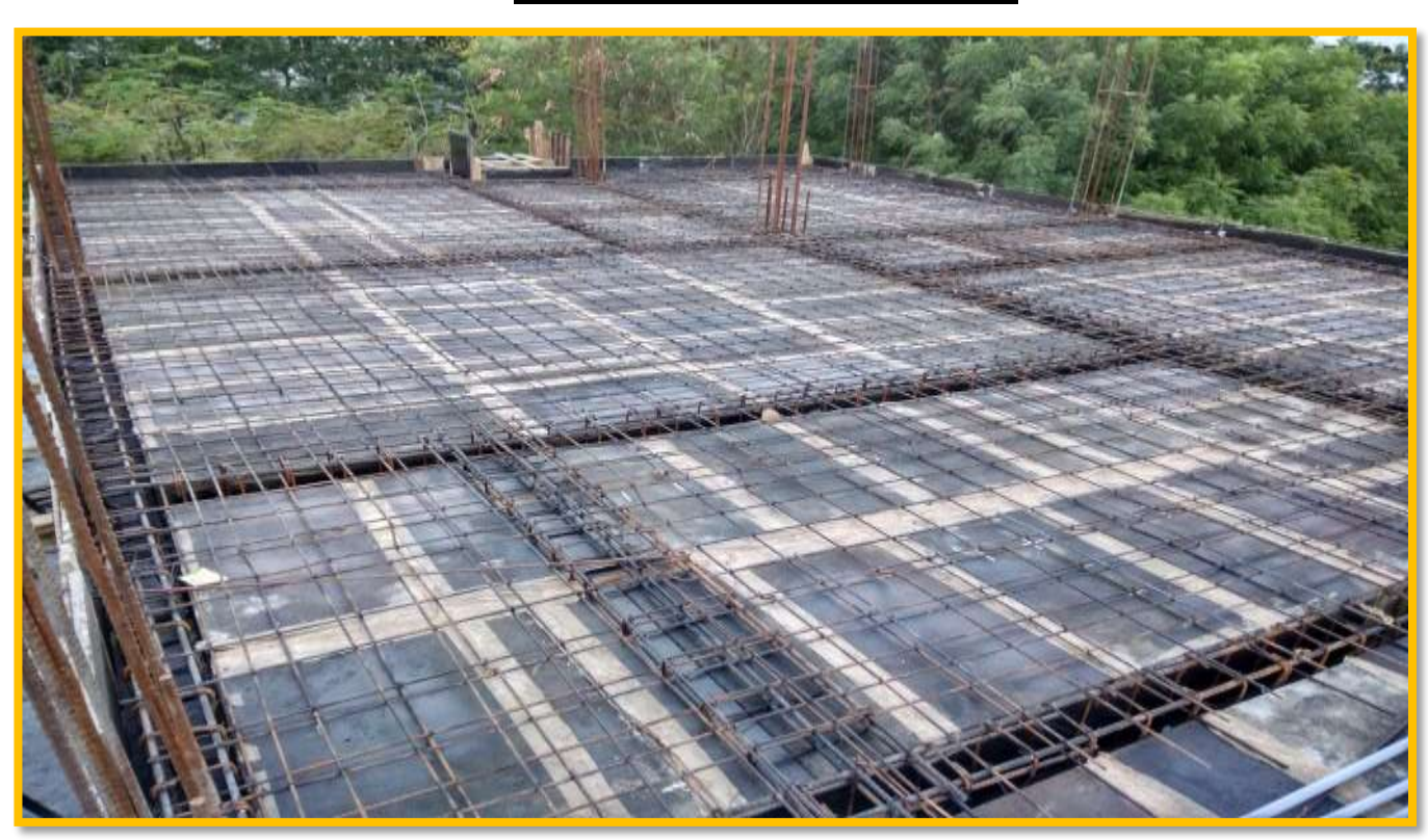
STARLITE SPINTECH LIMITED