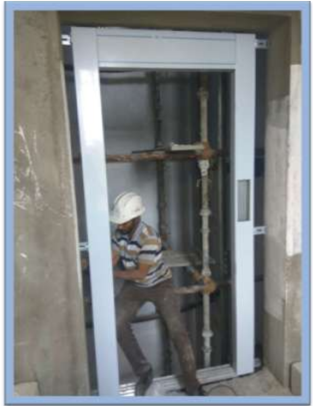
LIFT ASSAMBLING WORK IN PROGRESS