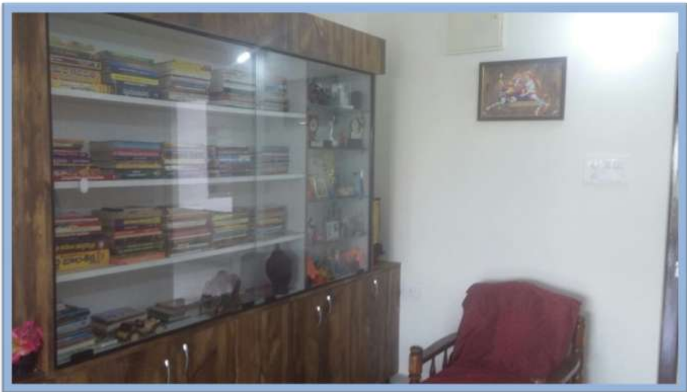
FLAT NO.203 INTERNAL SIDE