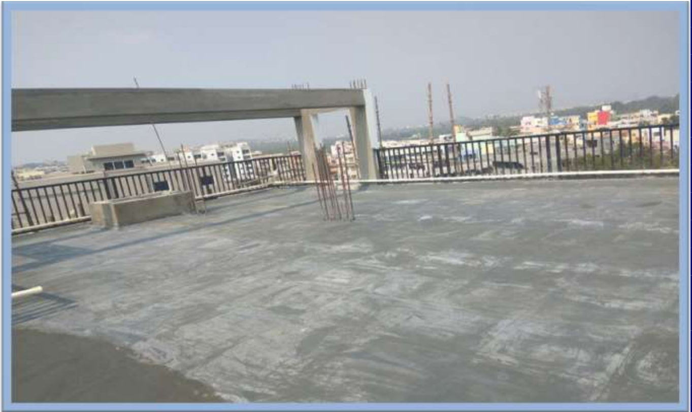
WATER PROOFING AT TERRACE AREA