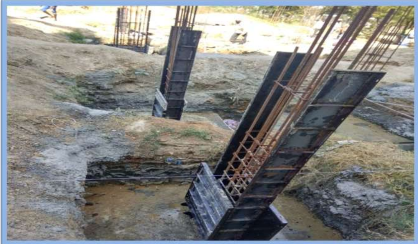
PEDESTAL CONCRETE WORK COMPLETED