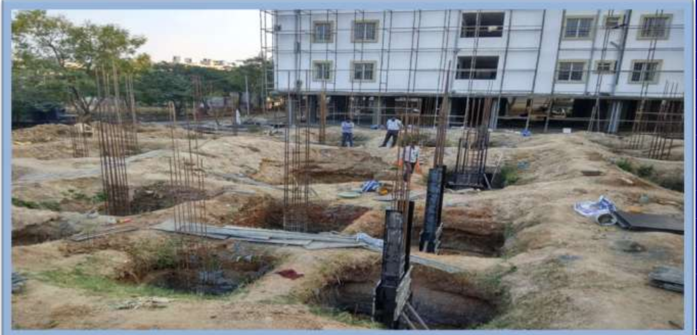
PEDESTAL CONCRETE WORK COMPLETED