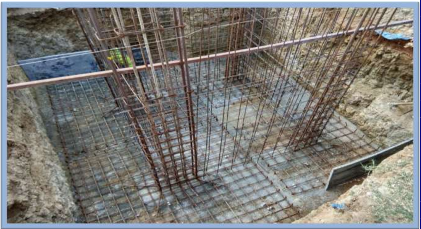
LIFT PIT FOOTING AND COLUMNS MATS