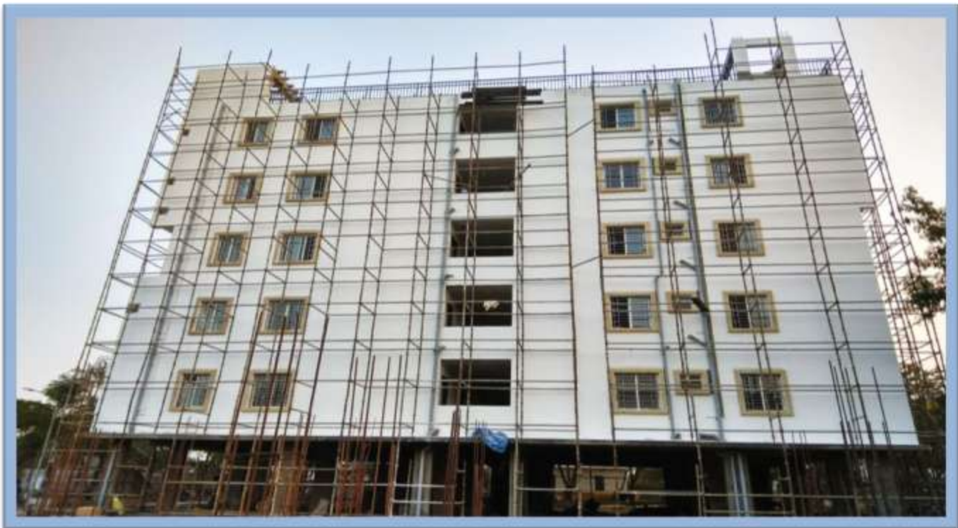
NORTH - SIDE ELEVATION