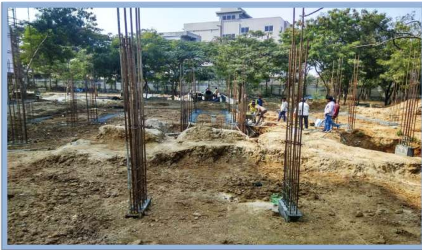
SOIL LEVELLING WORK COMPLETED