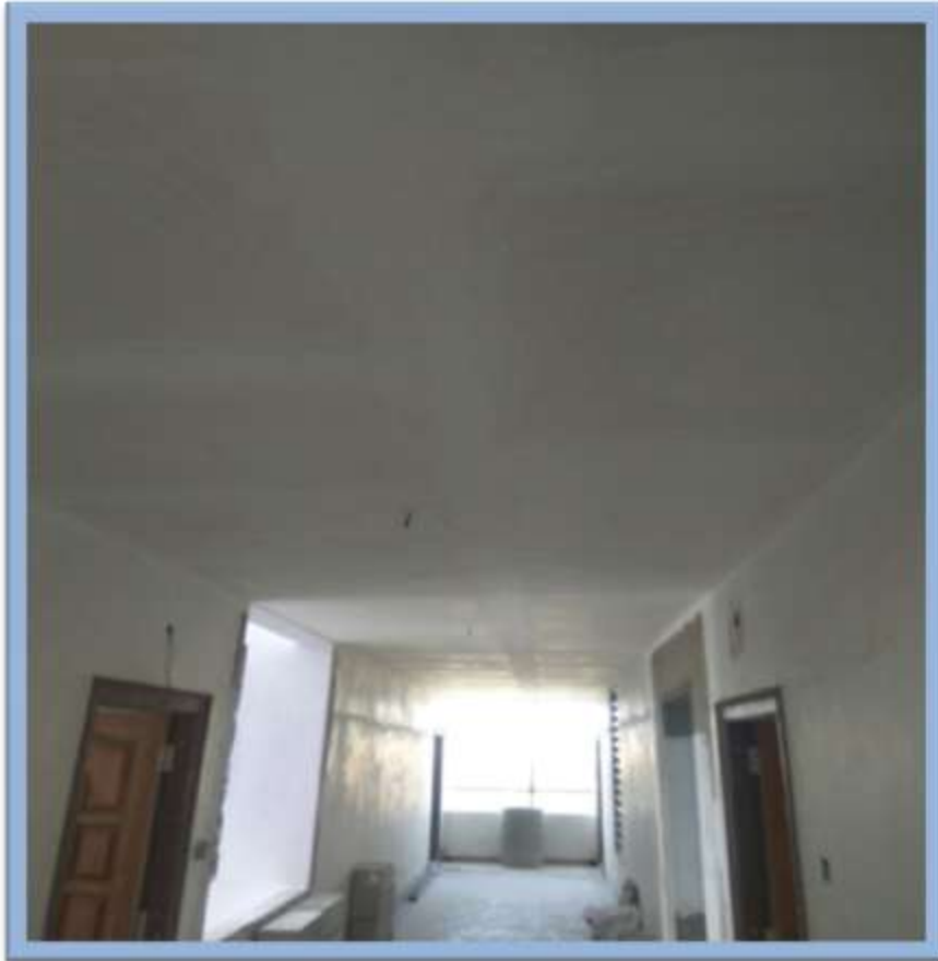
FALSE CEILING AT CORRIDOR AREA