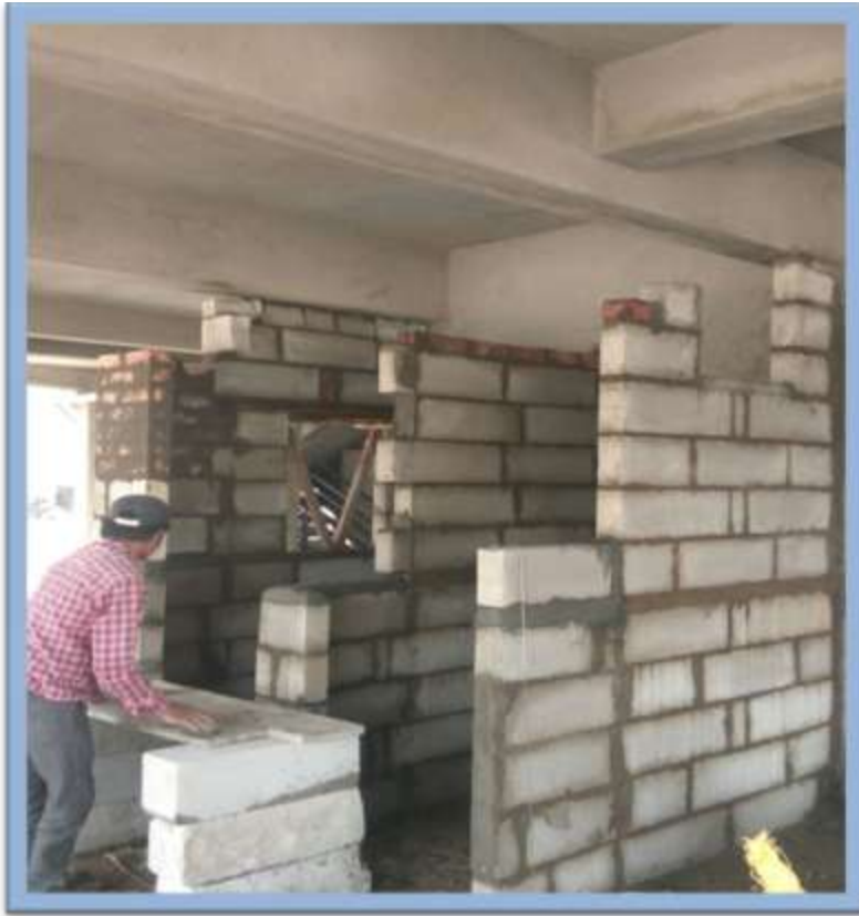
SECURITY ROOM WITH ATTACH TOILET WORK IN PROGRESS