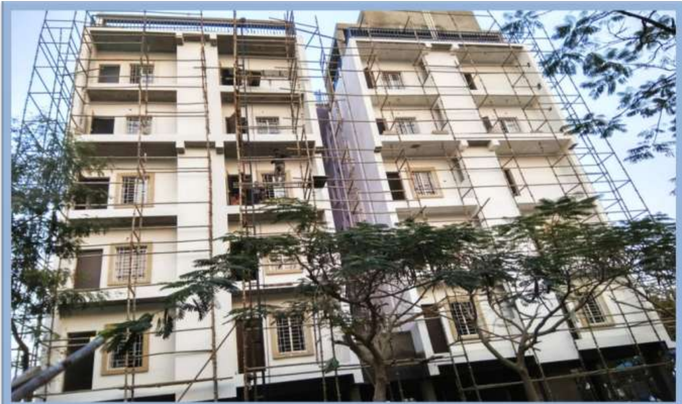
WEST & NORTH - SIDE ELEVATION