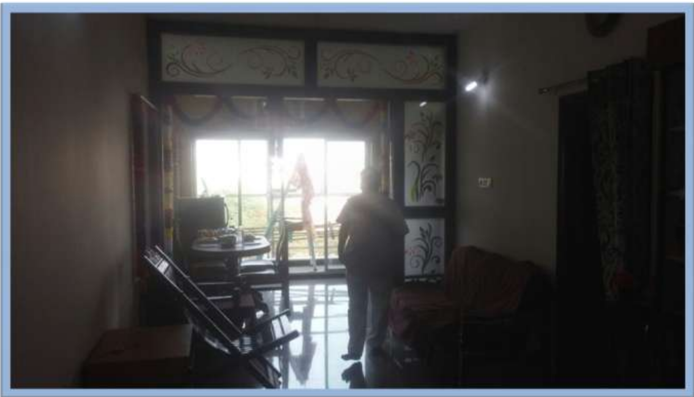
FLAT NO.203 INTERNAL SIDE