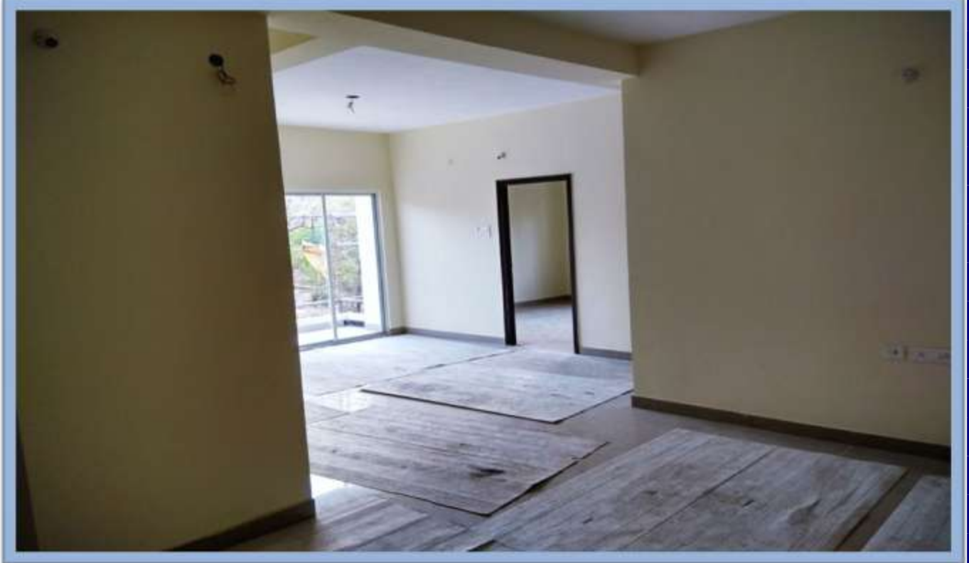
FLAT NO.101 INTERNAL SIDE