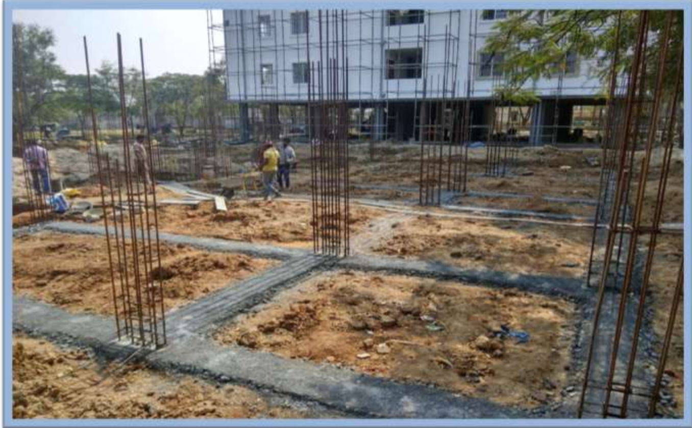
P.C.C. WORK FOR PLINTH BEAM PURPOSE