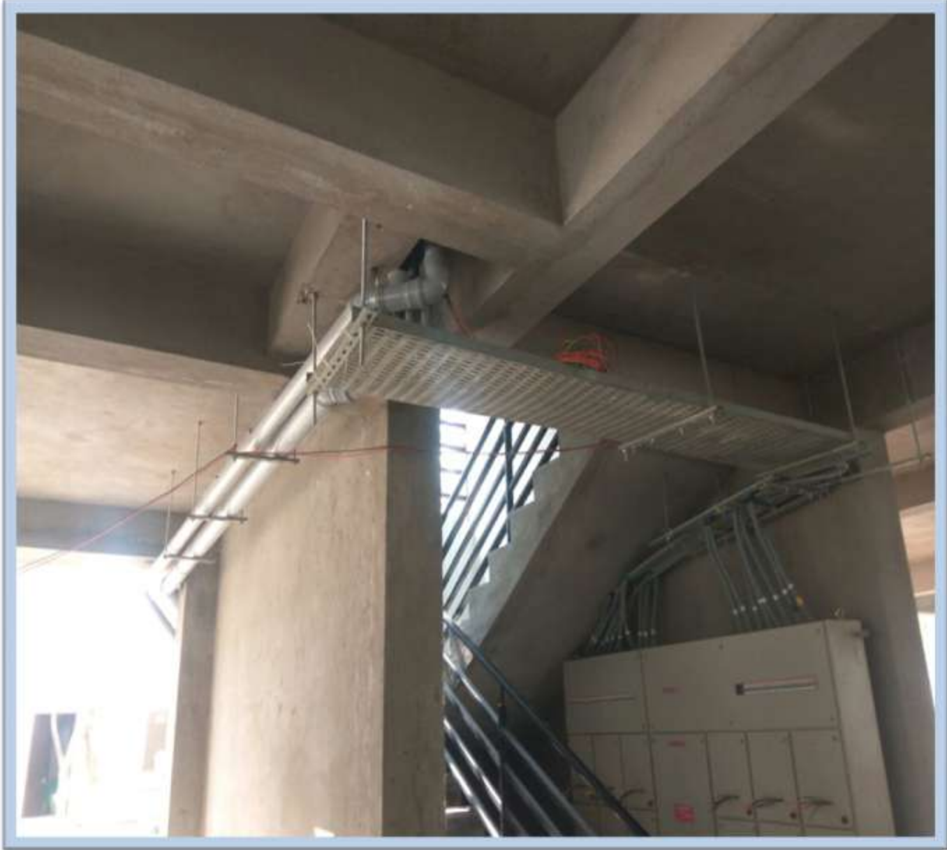
ELECTRICAL PANEL BOARD WITH MAINLINE TRENCH WORK