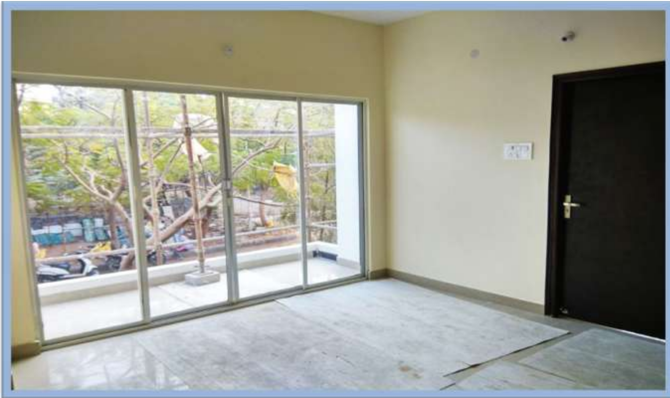
FLAT NO.101 INTERNAL SIDE