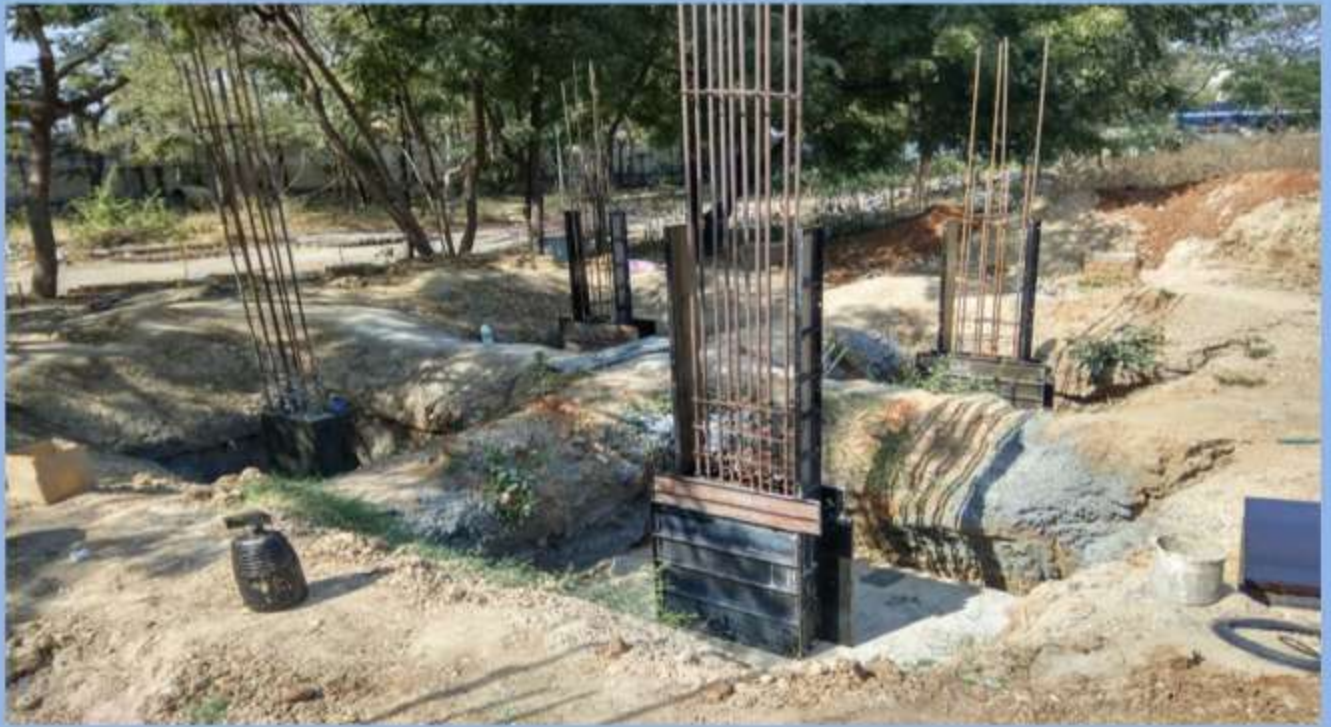
PEDESTAL CONCRETE WORK COMPLETED