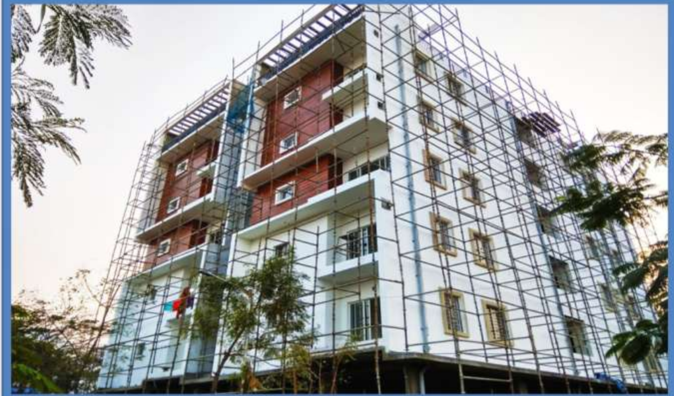
EASE - FRONT ELEVATION