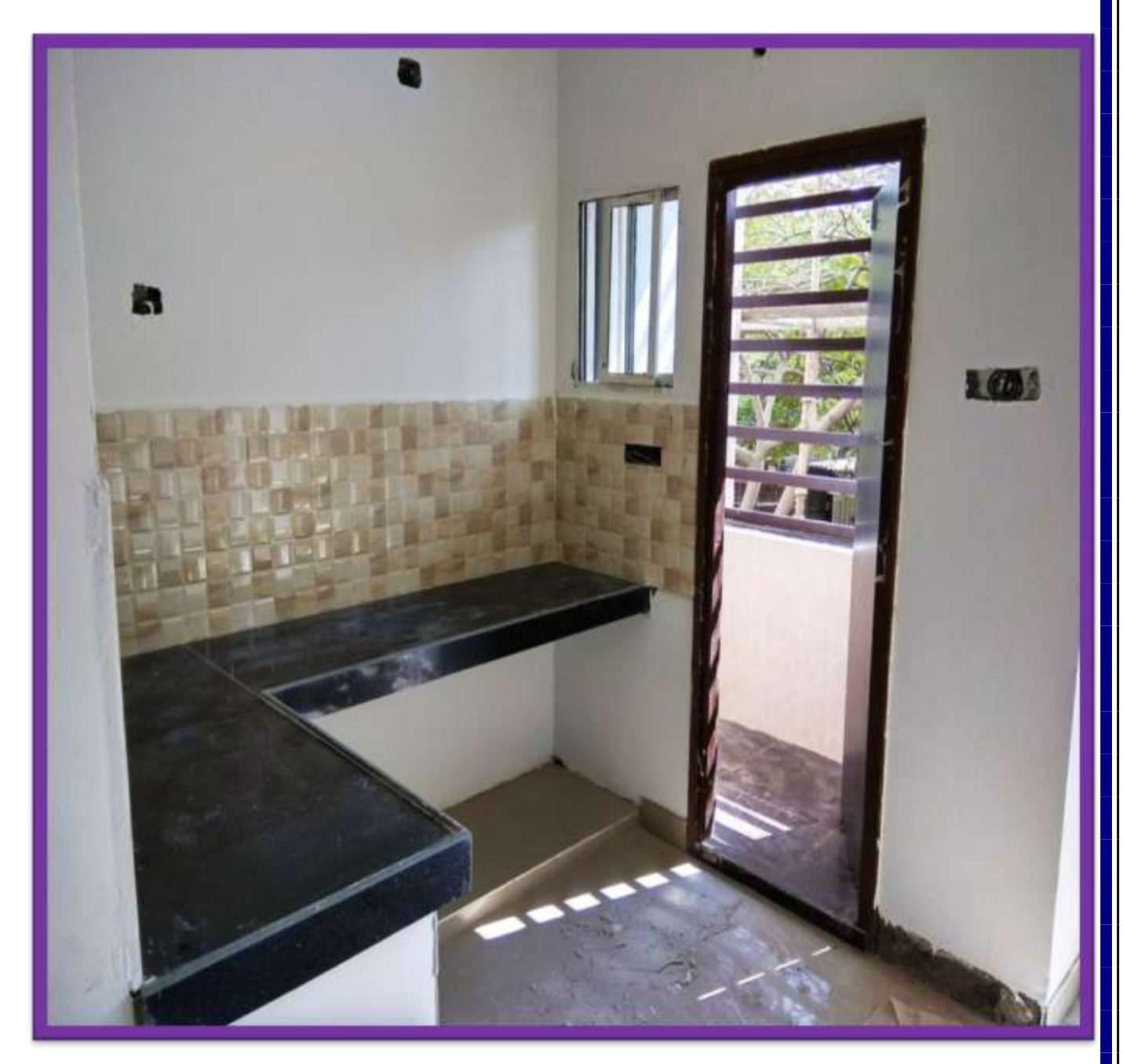
KITCHEN WALL DADO AND GRANITE PLATFORM WORK