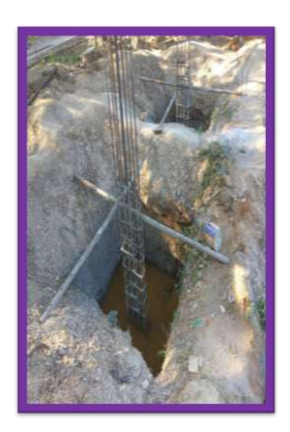
STARLITE SPINTECH LIMITED