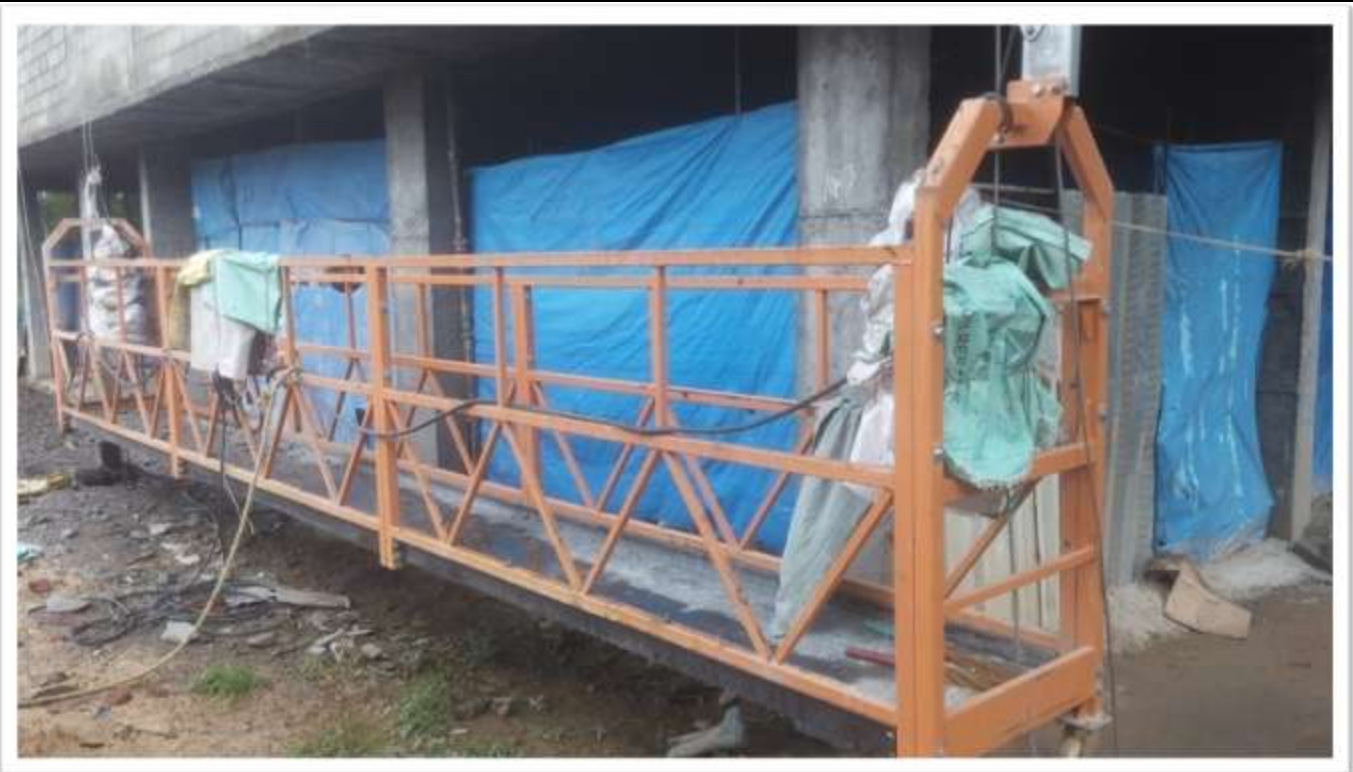
ROOF SUSPENDED PLATFORM MACHINE