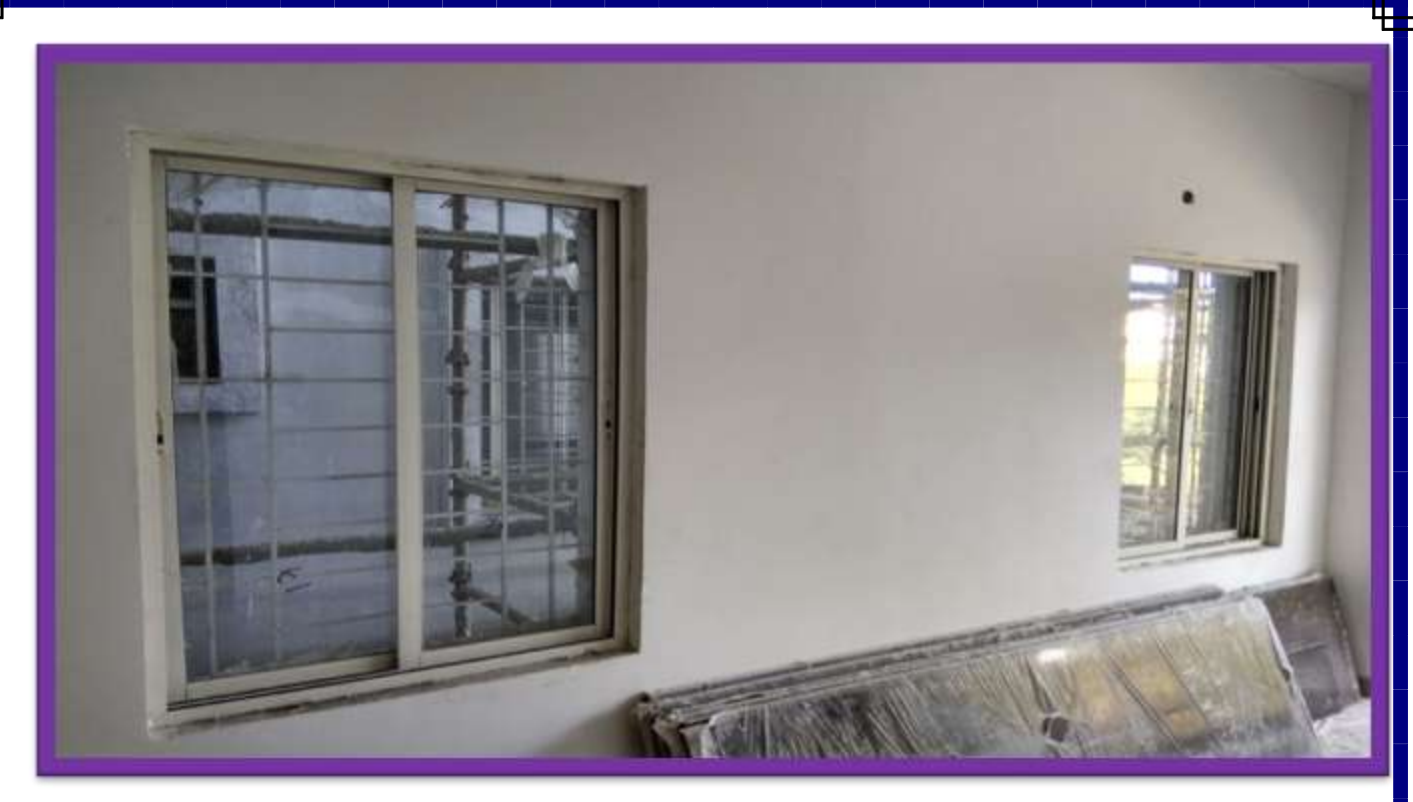
ALUMINUM FRAME & SHUTTER FIXING WORK