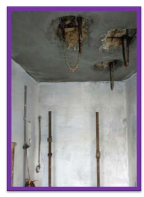
SCAFFOLDING AND HOOK WORK COMPLETED FOR LIFT WORK PURPOSE.