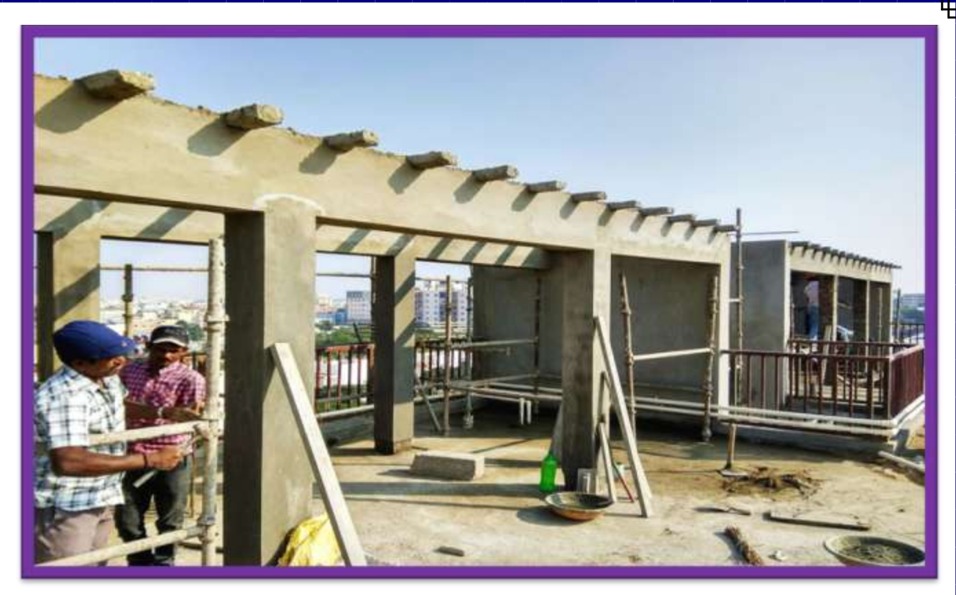
ELEVATION PERGOLA WORK