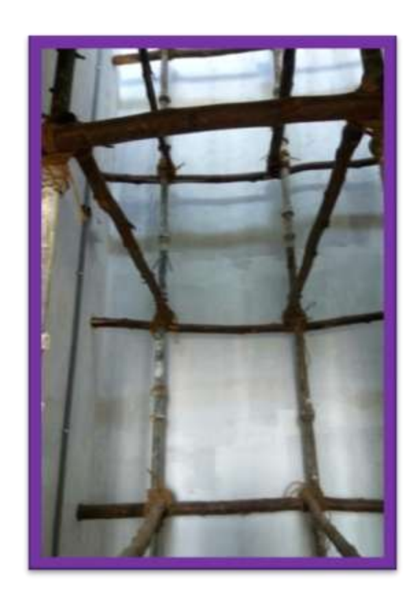
STARLITE SPINTECH LIMITED