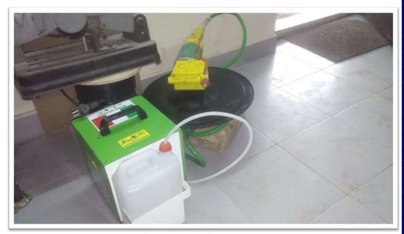
PASTERING FINISHING MACHINE