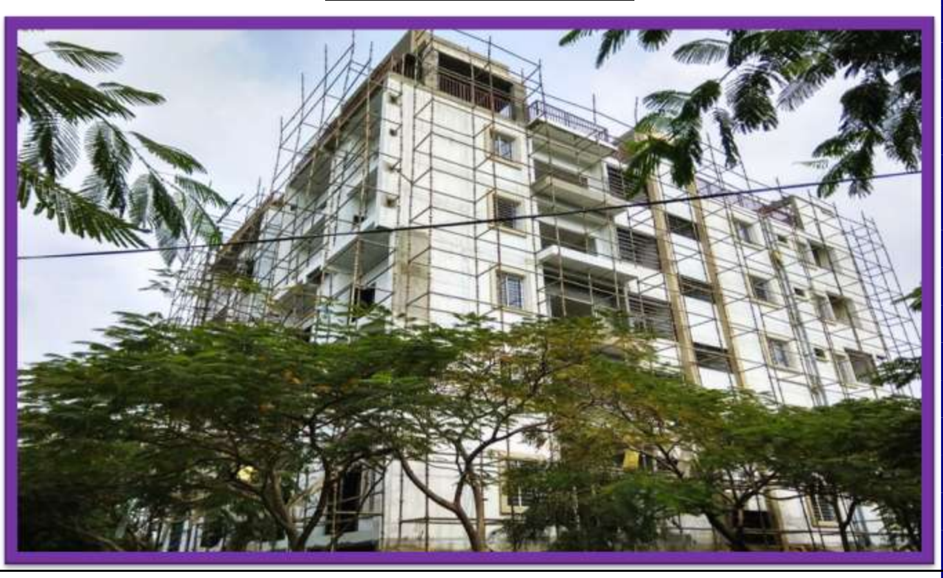
STARLITE SPINTECH LIMITED