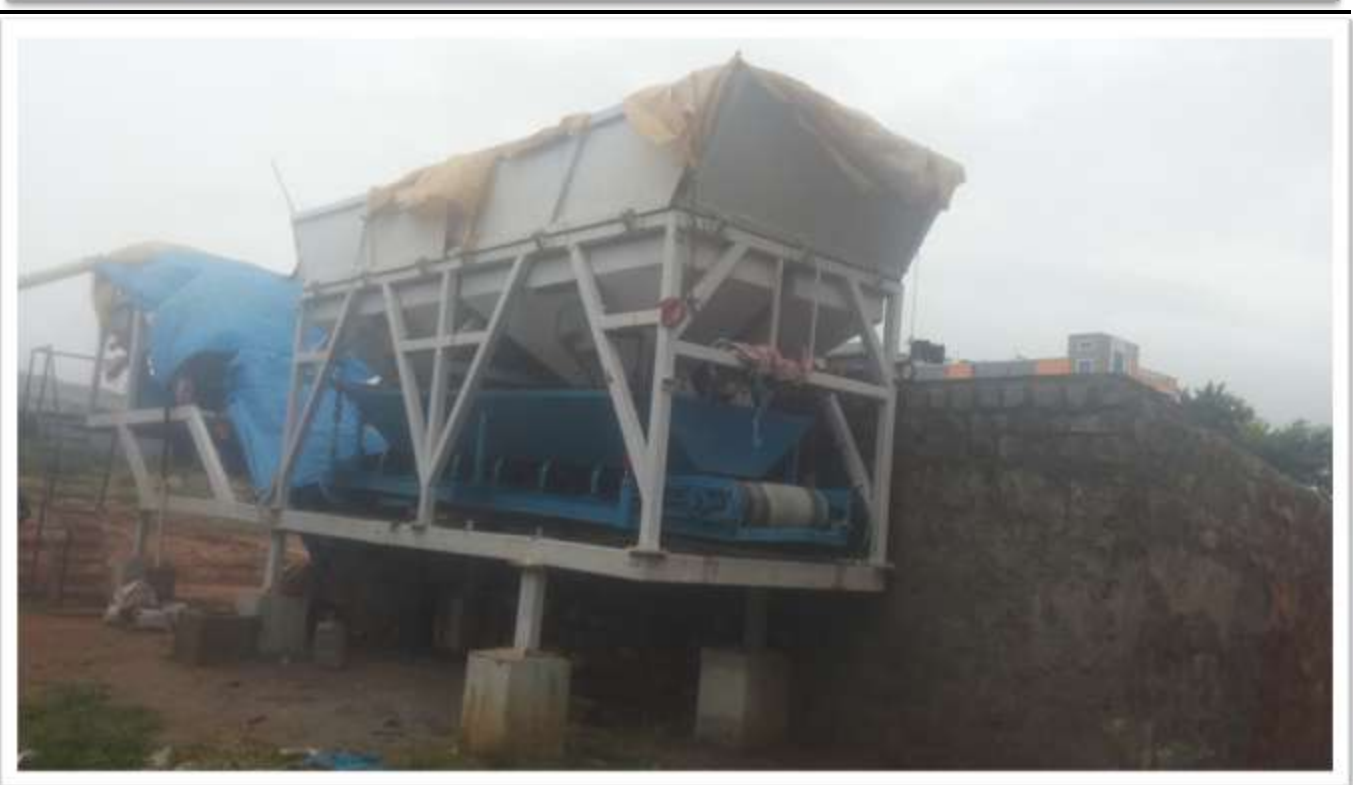
READY MIX CONCRETE MIXING BATCHING PLANT