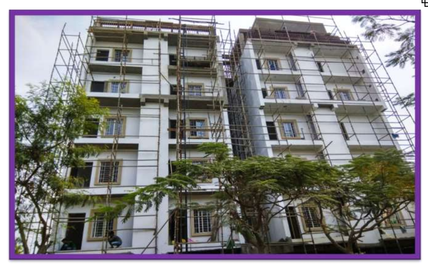
WEST SIDE ELEVATION WORK