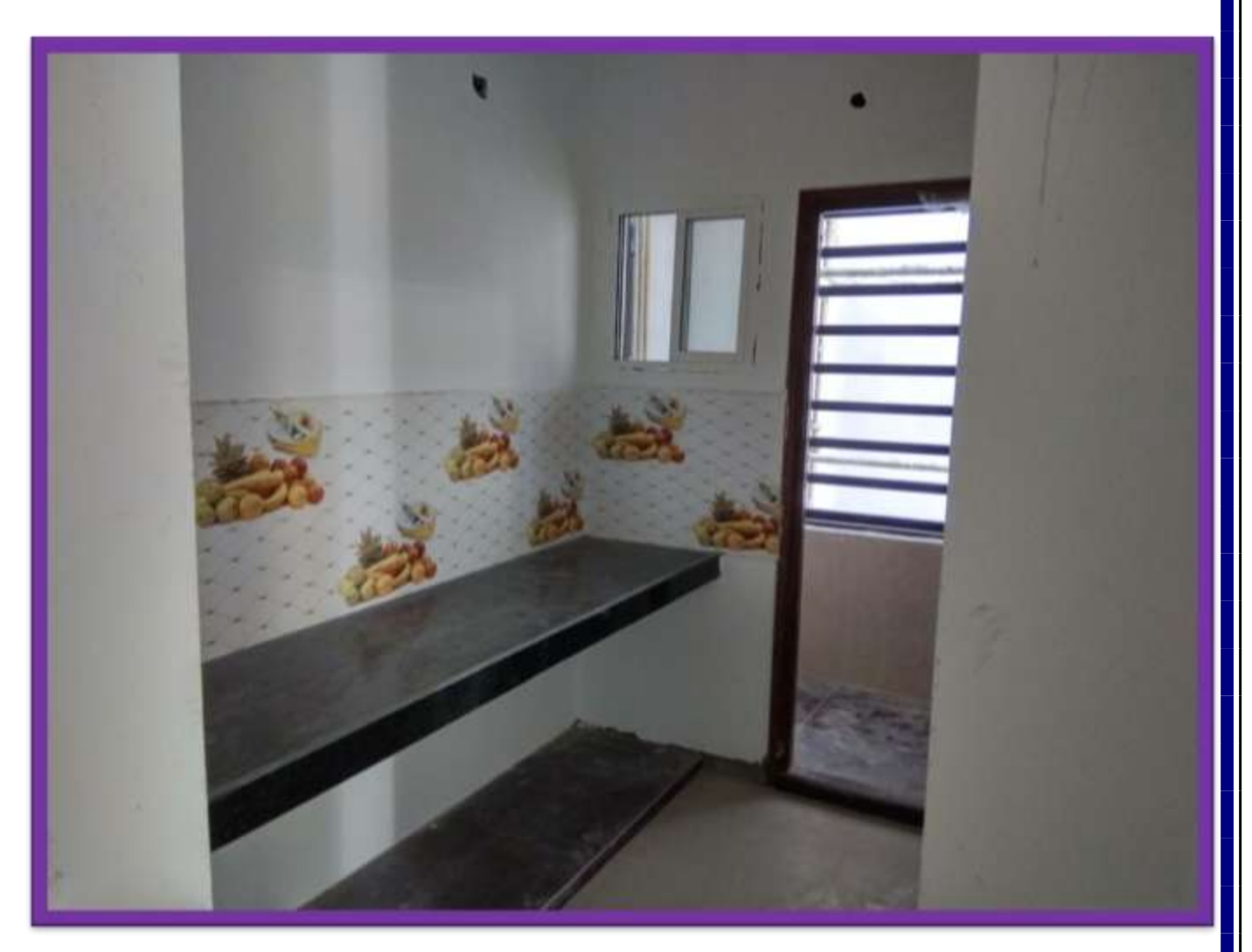
KITCHEN WALL DADO AND GRANITE PLATFORM WORK