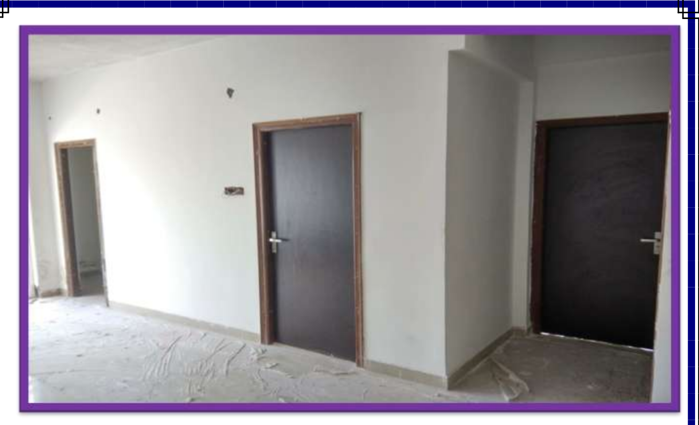
DOORS FRAME & DOORS WITH HARDWARE FIXING WORK