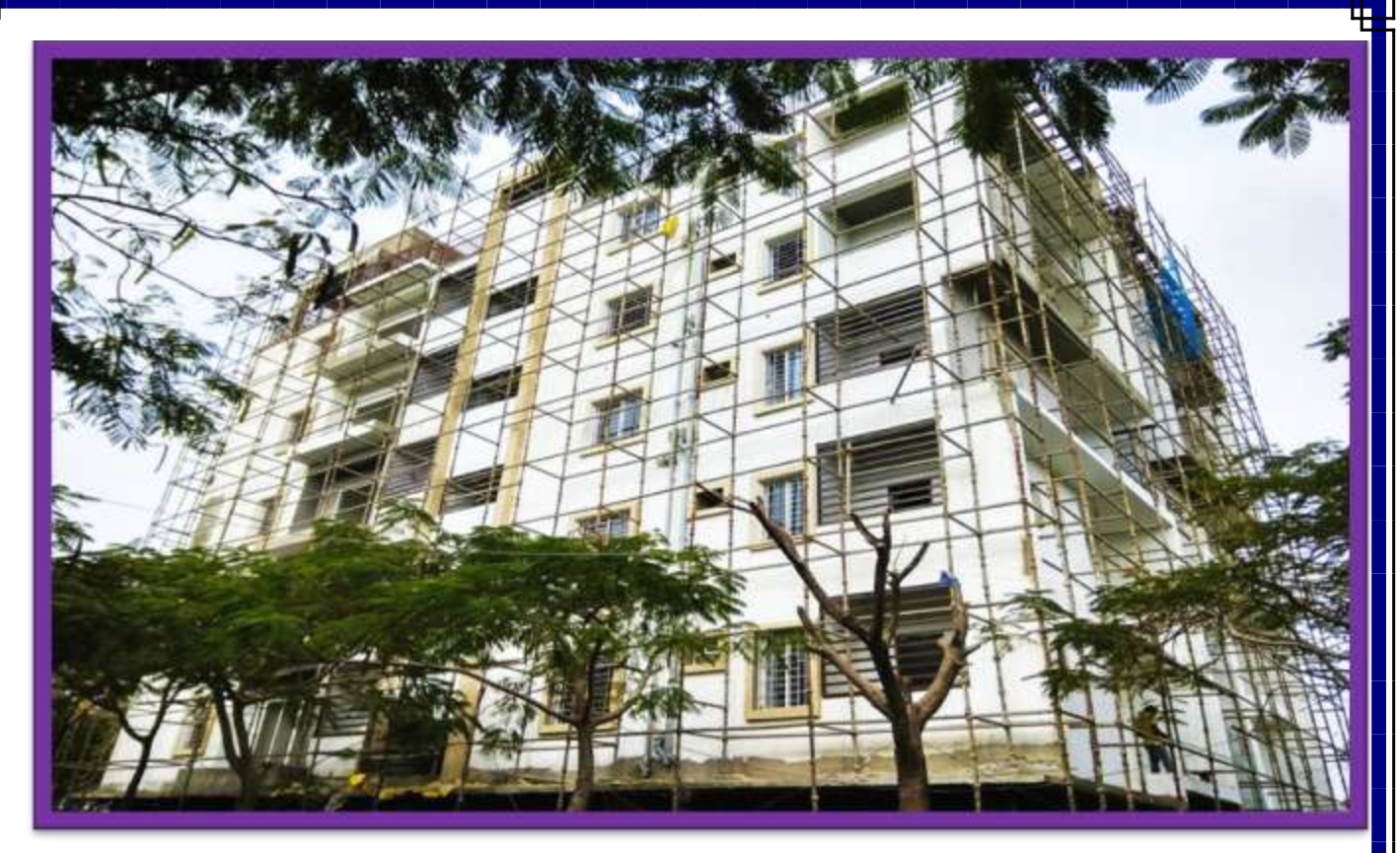
SOUTH & NORTH SIDE ELEVATION WORK