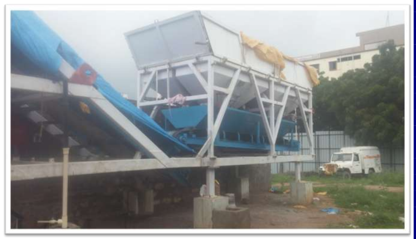
READY MIX CONCRETE MIXING BATCHING PLANT