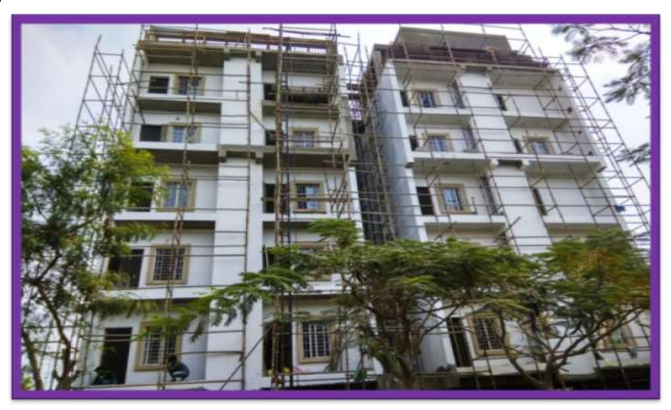
EAST SIDE FRONT ELEVATION WORK