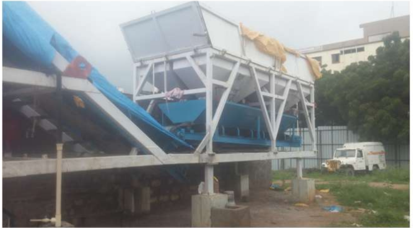
READY MIX CONCRETE MIXING BATCHING PLANT