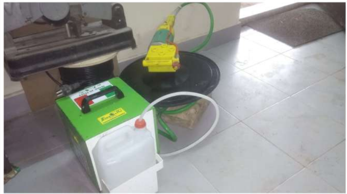
PASTERING FINISHING MACHINE