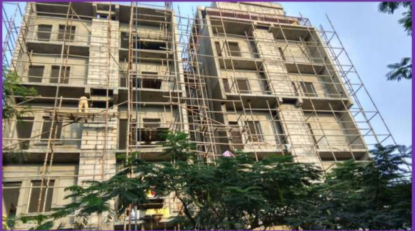
West & North Side Elevation work