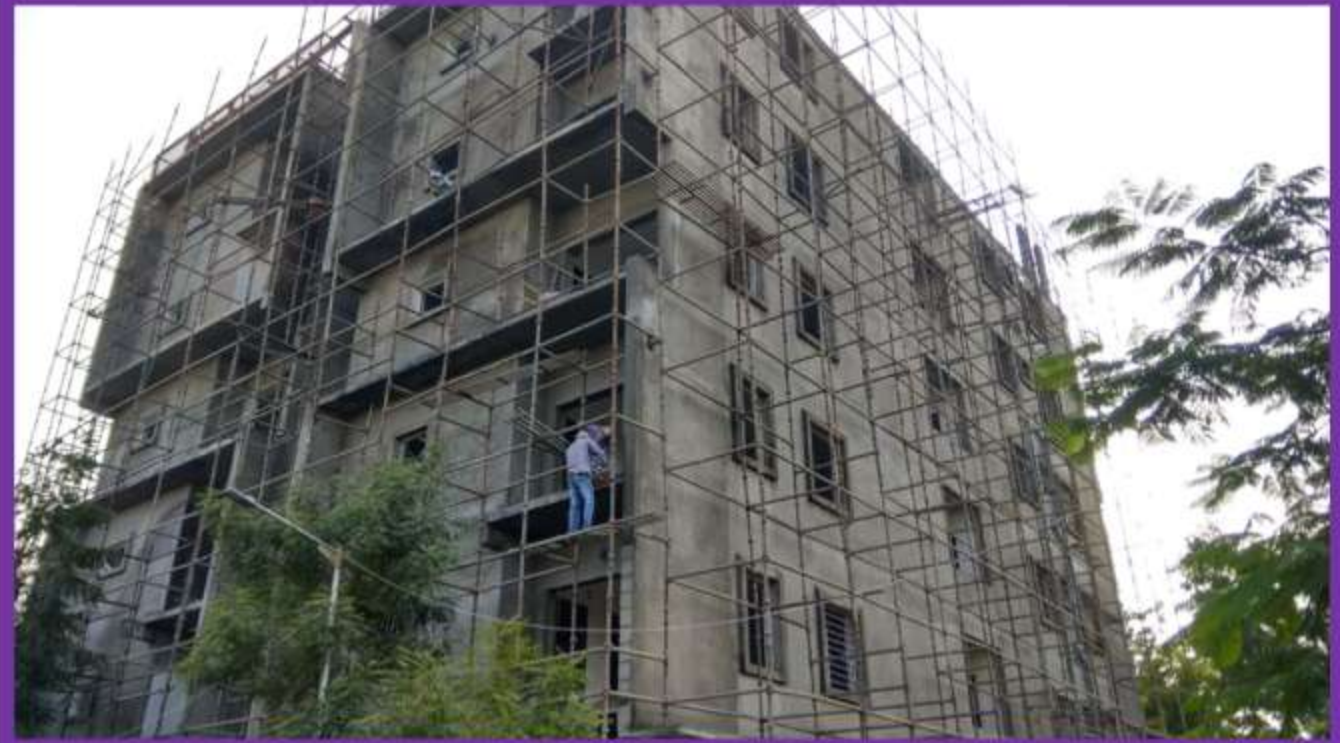
East and North Side Elevation work