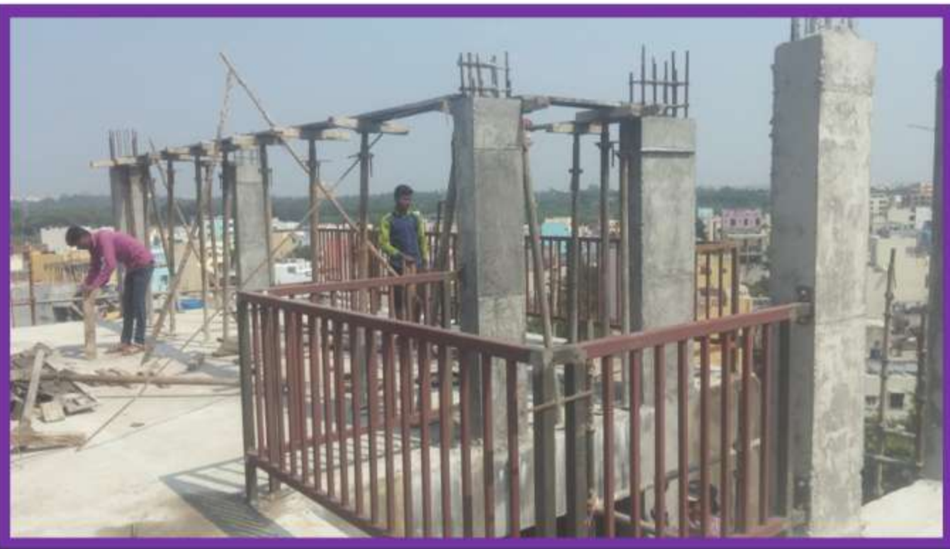
M.S.Railing fixing work completed at Terrace Area.