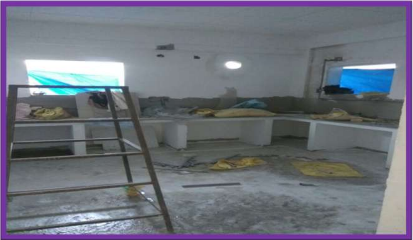
Marble Laying work in progress.