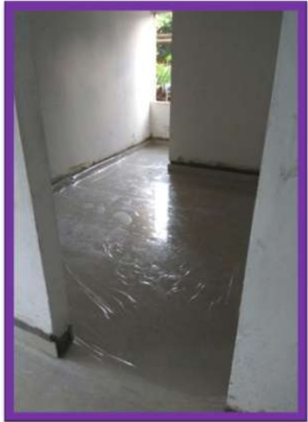
5 th Floor All Flats Vitrified Tiles laying work completed.