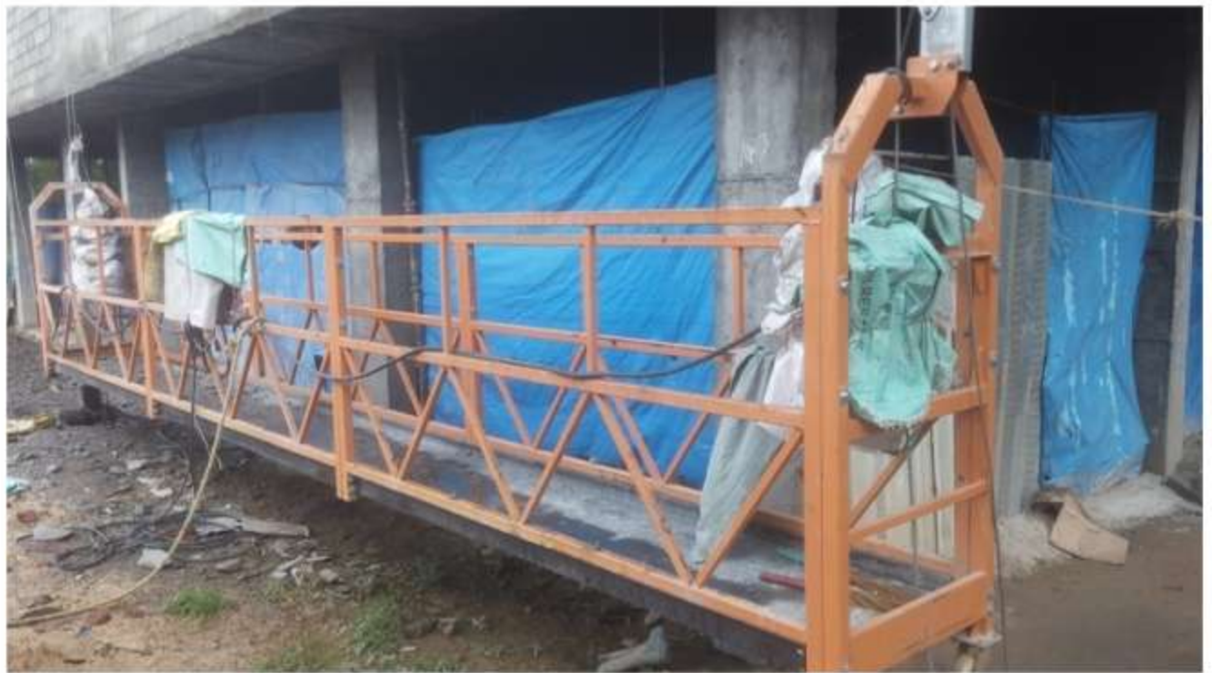
ROOF SUSPENDED PLATFORM MACHINE