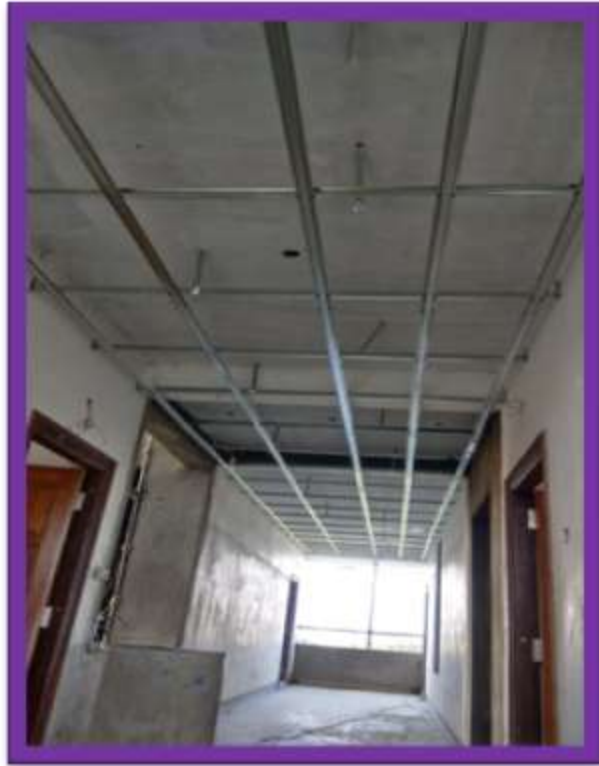
AluminumChannel for False Ceiling fixing work completed.