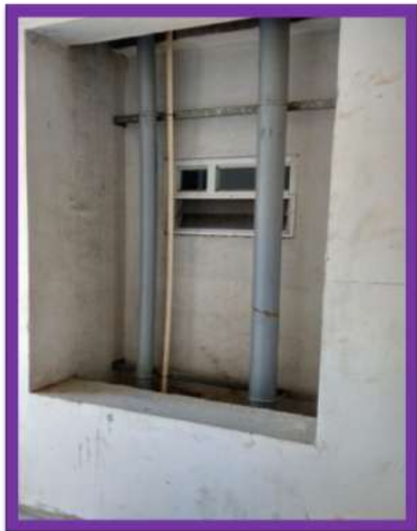
CPVC & PVC Line and Aluminum ventilator fixed work