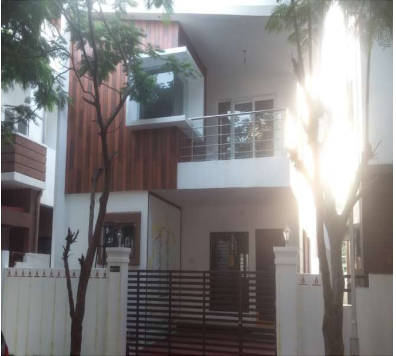
VILLA NEW MODEL ELEVATION