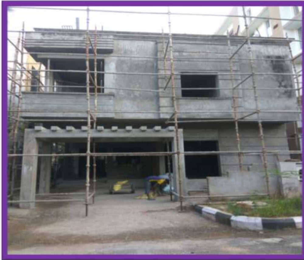
Front Side External Elevation work