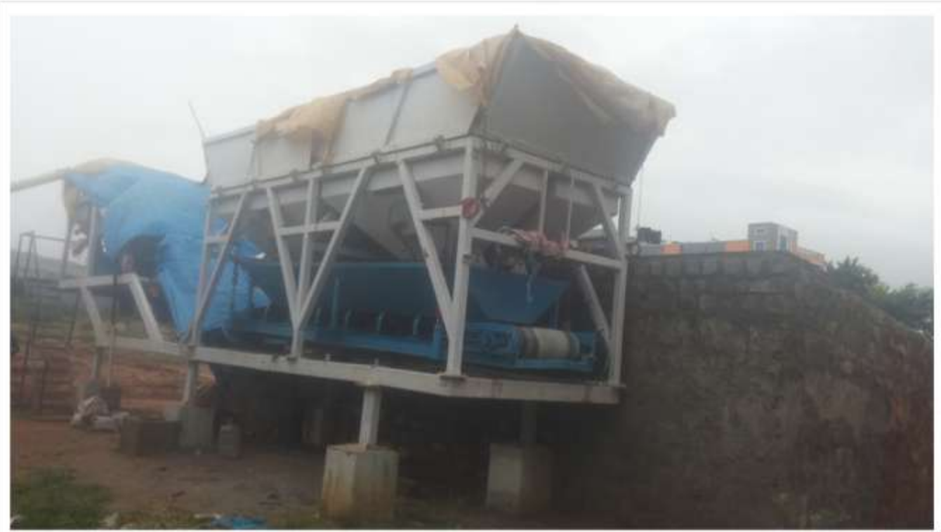
READY MIX CONCRETE MIXING BATCHING PLANT