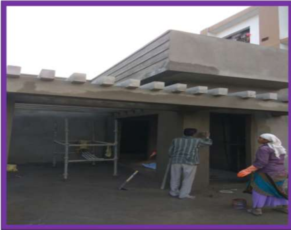
Terrace Pergola Elevation plastering work