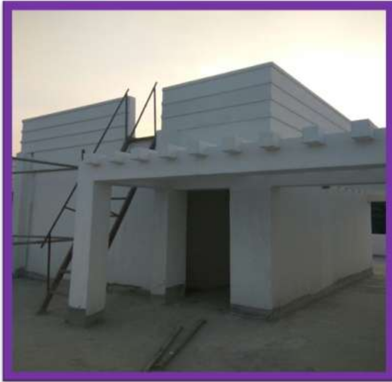
Pergola Luppum work completed.