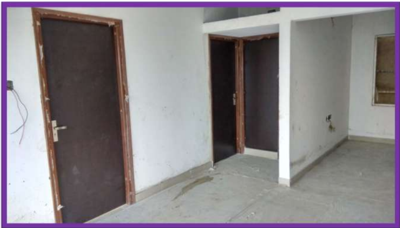
Doors Frames & Shutter fixing work completed.