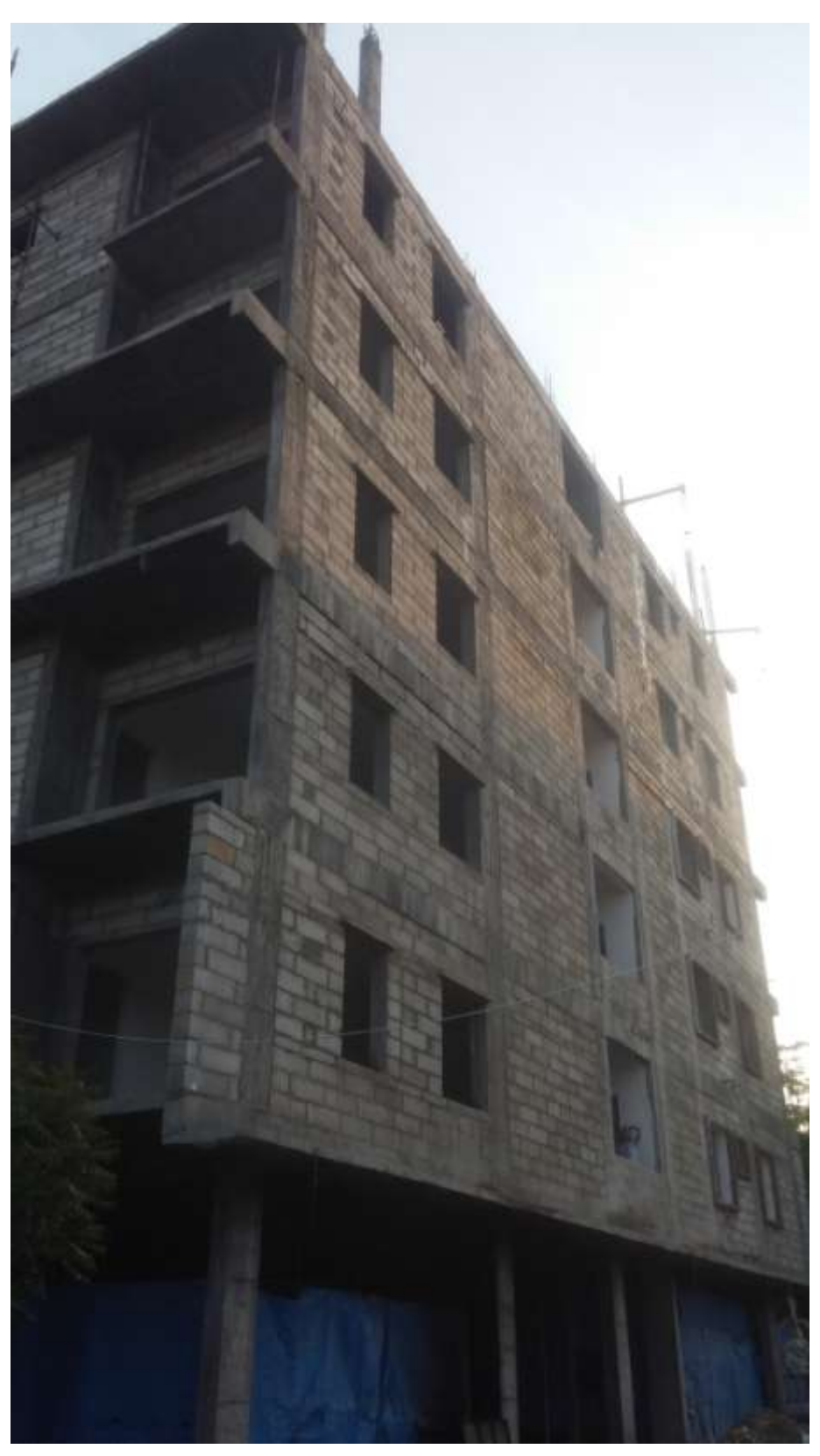
NORTH SIDE ELEVATION BRICK WORK