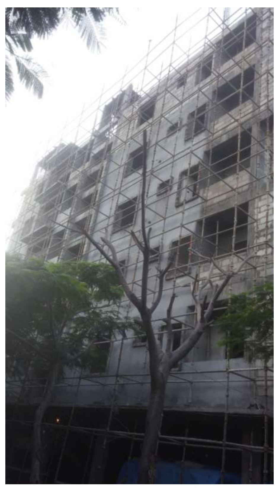
SOUTH SIDE ELEVATION BRICK WORK