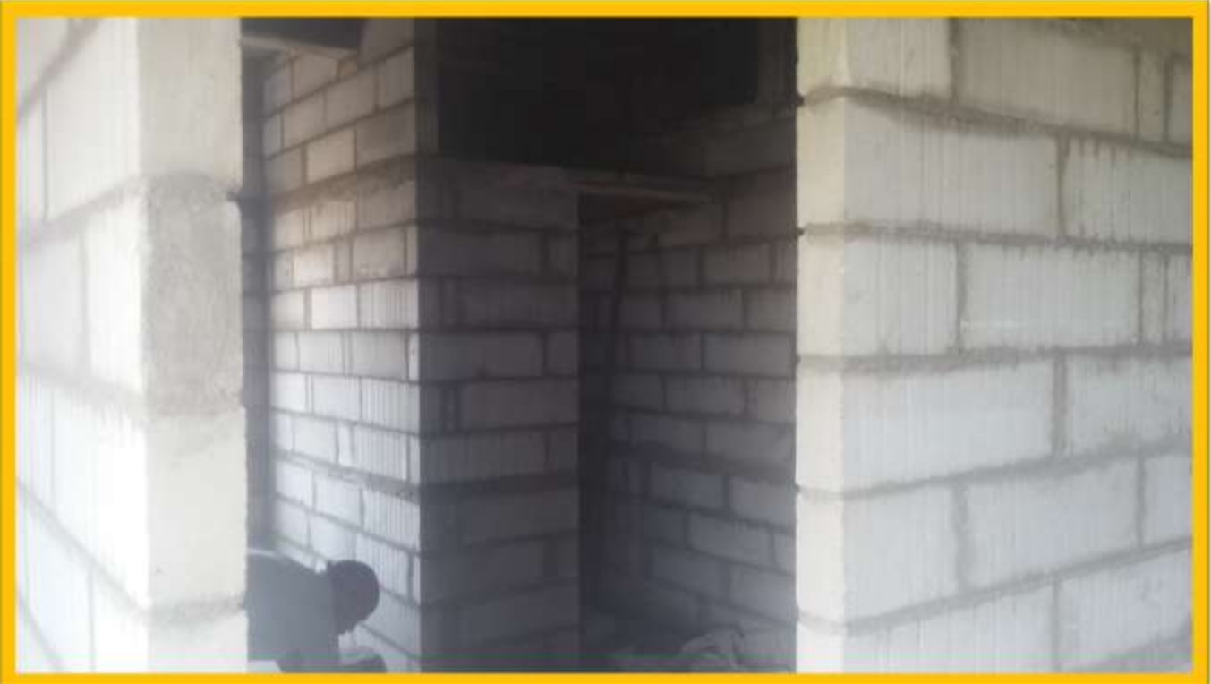
5<sup>TH</sup> FLOOR BRICK WORK