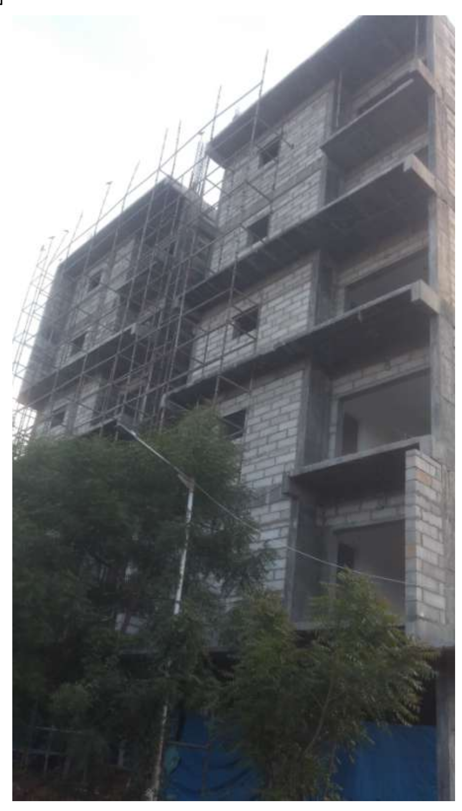
EAST SIDE ELEVATION BRICK WORK