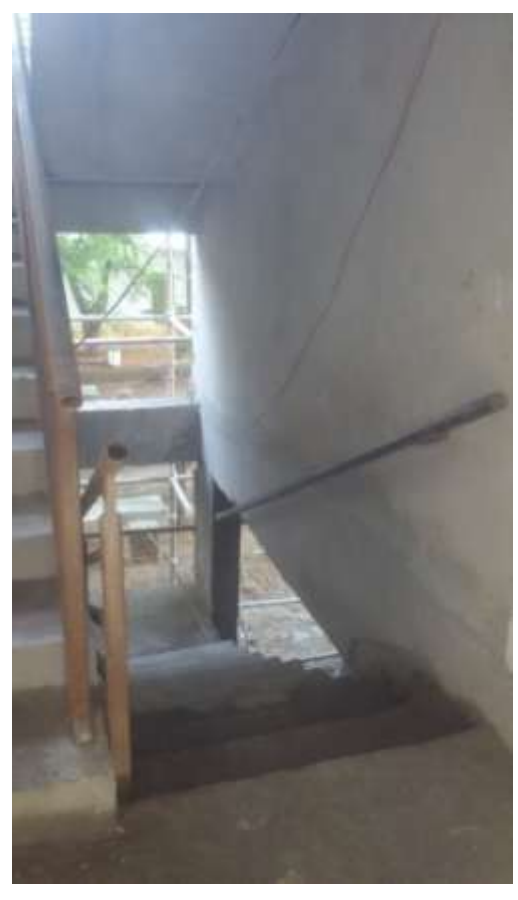
M.S. RAINING WORK ABOVE STAIRCASE WORK