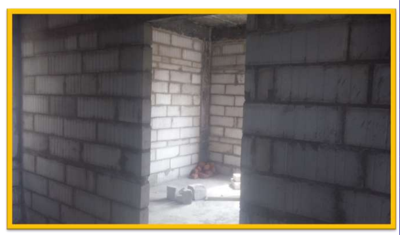
5<sup>TH</sup> FLOOR BRICK WORK