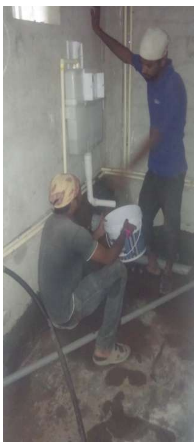
INTERNAL CPVC PIPE LINE LECKAGE CHECKING WORK