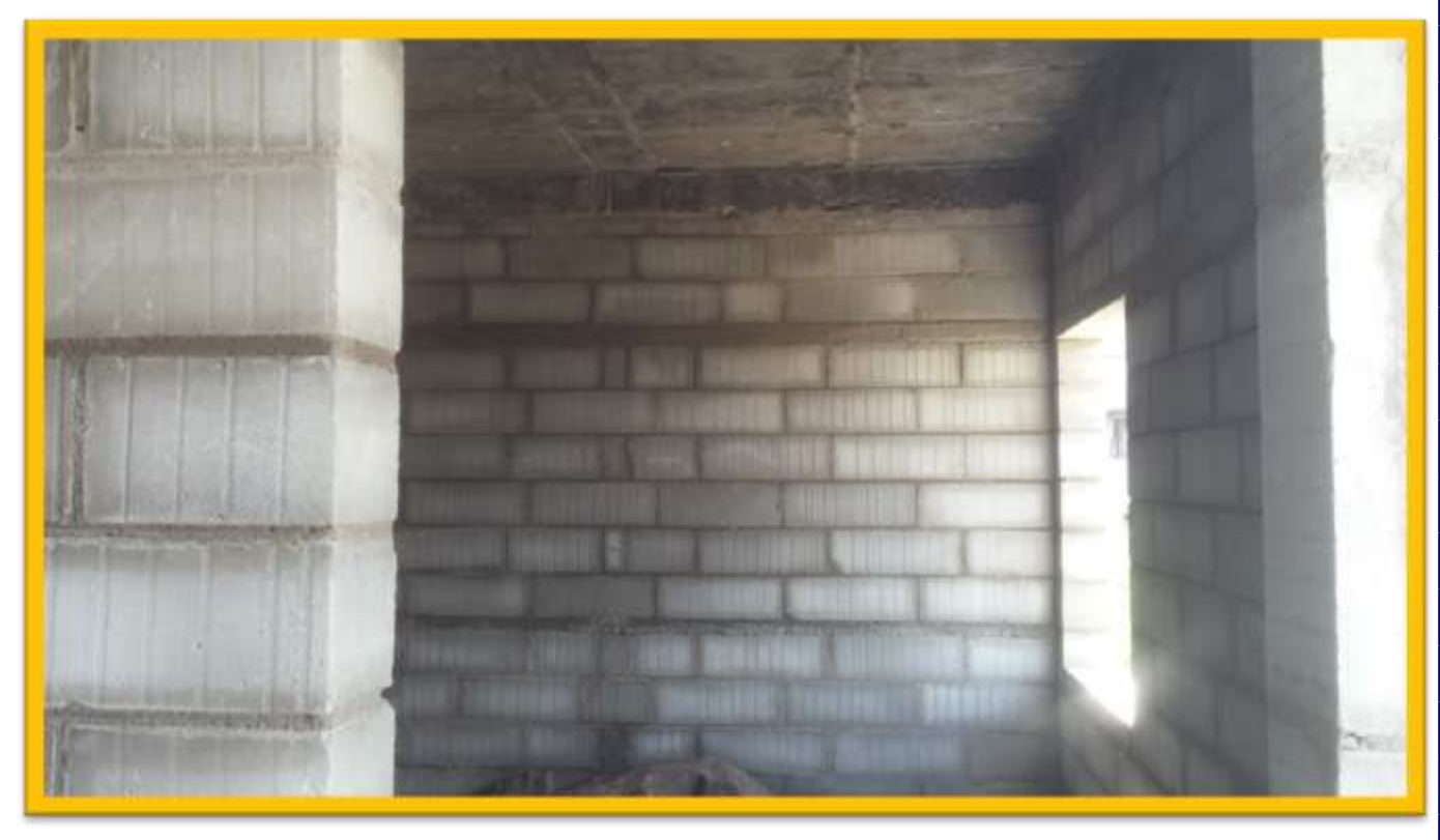
5<sup>TH</sup> FLOOR BRICK WORK