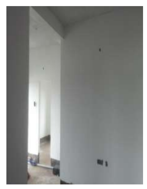
STARLITE SPINTECH LIMITED